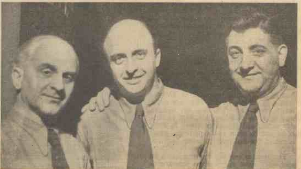
THREE MERRY MEN OF COLOGNE. —The famous trio who with their "magic" lantern illuminate world affairs in their own inimitable style. They recently returned to the microphone after an absence of over a year.

CBF, Canada's new 50 kW station at Verchères, Quebec, 35 miles east of Montreal, was officially opened on the evening of December 11 by the Hon. C. D. Howe, Minister of Transport, and the Rt. Hon. Ernest Lapointe, Minister of Justice of Canada. The station, one of six to be erected across Canada by the Canadian Broadcasting Commission is the most powerful in the Dominion, and ranks high amongst the stations of the