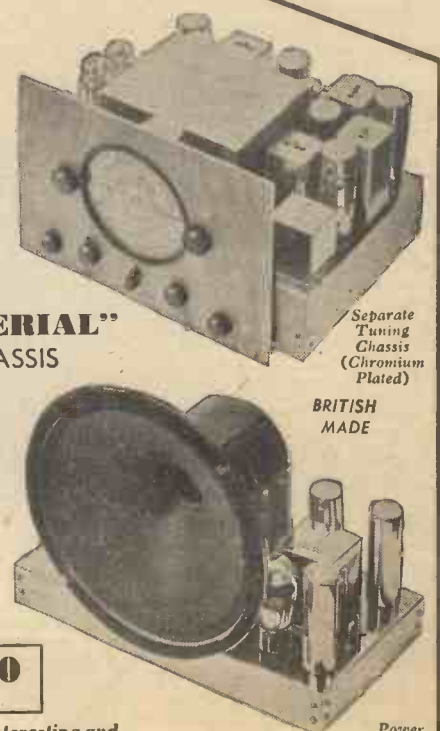
Separate Tuning Chassis (Chromium Plated)

MIDWEST RADIO (MFG.) CO., LTD. 16, Old Town, Clapham, London, S.W.4. Telephone: (Nr. Clapham Common Tube Station, Morden-Edgware Line) MACaulay 5005.