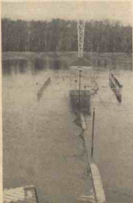
The waterlogged short-wave transmitter at Wayne.

When there are neither floods nor blizzards lightning saves things from getting dull for the men at the Wayne transmitters. Whenever a thunderstorm breaks they all know the towering aerial is going to be hit—"and hit hard" according to the supervisor. The consequent crash can be heard for miles around, although conductors keep the damage to a minimum.