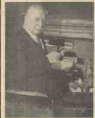
A recent portrait of Lehár, whose "Count of Luxemburg" forms the Beromünster programme at 6.55 p.m.