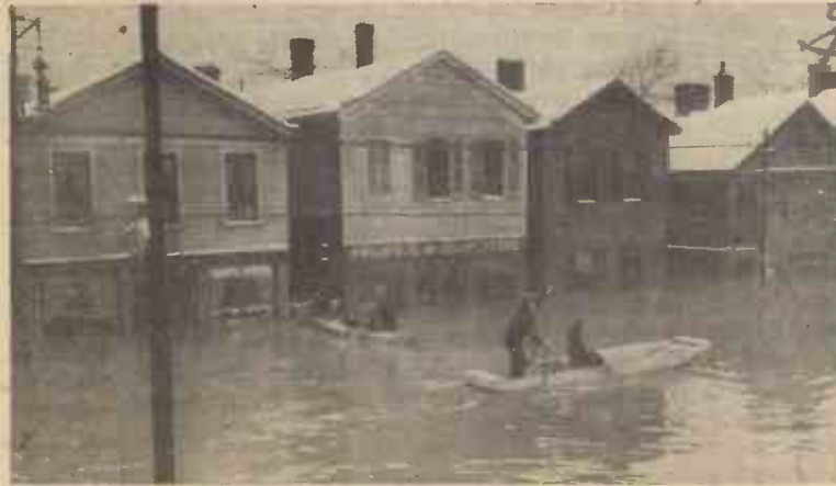
The disastrous Ohio Floods.

A conference at Buenos Aires instituted a Pan-American Hour, to be given weekly if possible. During this hour all national propaganda should cease, and the broadcasting stations of each country concerned would