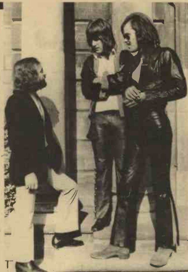
THE NICE — a new album issued this month . . .