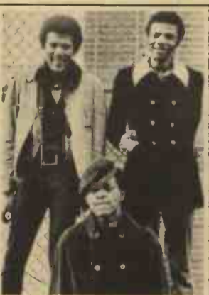
THE DELFONICS "Sound Of Sexy Soul" — Ready Or Not Here I Come; Let It Be Me; Hot Dog (I Love You So); You Can't Be Loving Him; Ain't That Peculiar; With These Hands; Face It Girl; It's Over; Going Out Of My Head; My New Love; Somebody Loves You; Scarborough Fair; Everytime I See My Baby (Bell SBL 121 stereo).