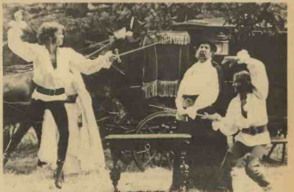
The Bee Gees in action.