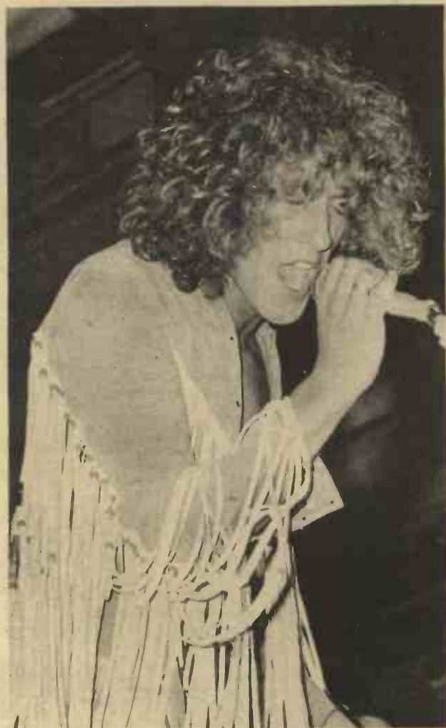
ROGER DALTRY—listen to 'Tommy' says a reader