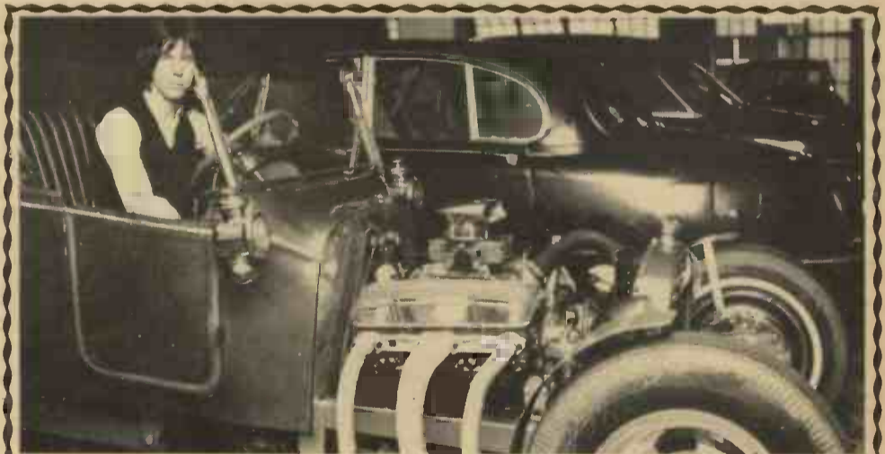
THE JEFF BECK GROUP "Cosa Nostra Beck-Ola" — All Shook Up; Spanish Boots; Girl From Mill Valley; Jailhouse Rock; Plymth (Water Down The Drain); The Hankman's Knee; Rice Pudding (Columbia SCX 6351 stereo).

JERRY LEE LEWIS "I'm On Fire" — Memphis Beat; Pen And Paper; I'm On Fire; She Was My Baby (He Was My Friend); This Must Be The Place; What A Heck Of A Mess; Rockin' Pneumonia and Boogie Woogie Flu; If I Had To Do It All Over; Hit The Road Jack; The Hole He Said He'd Dig For Me; Bread And Butter Man