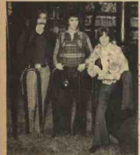
Three Dog Night