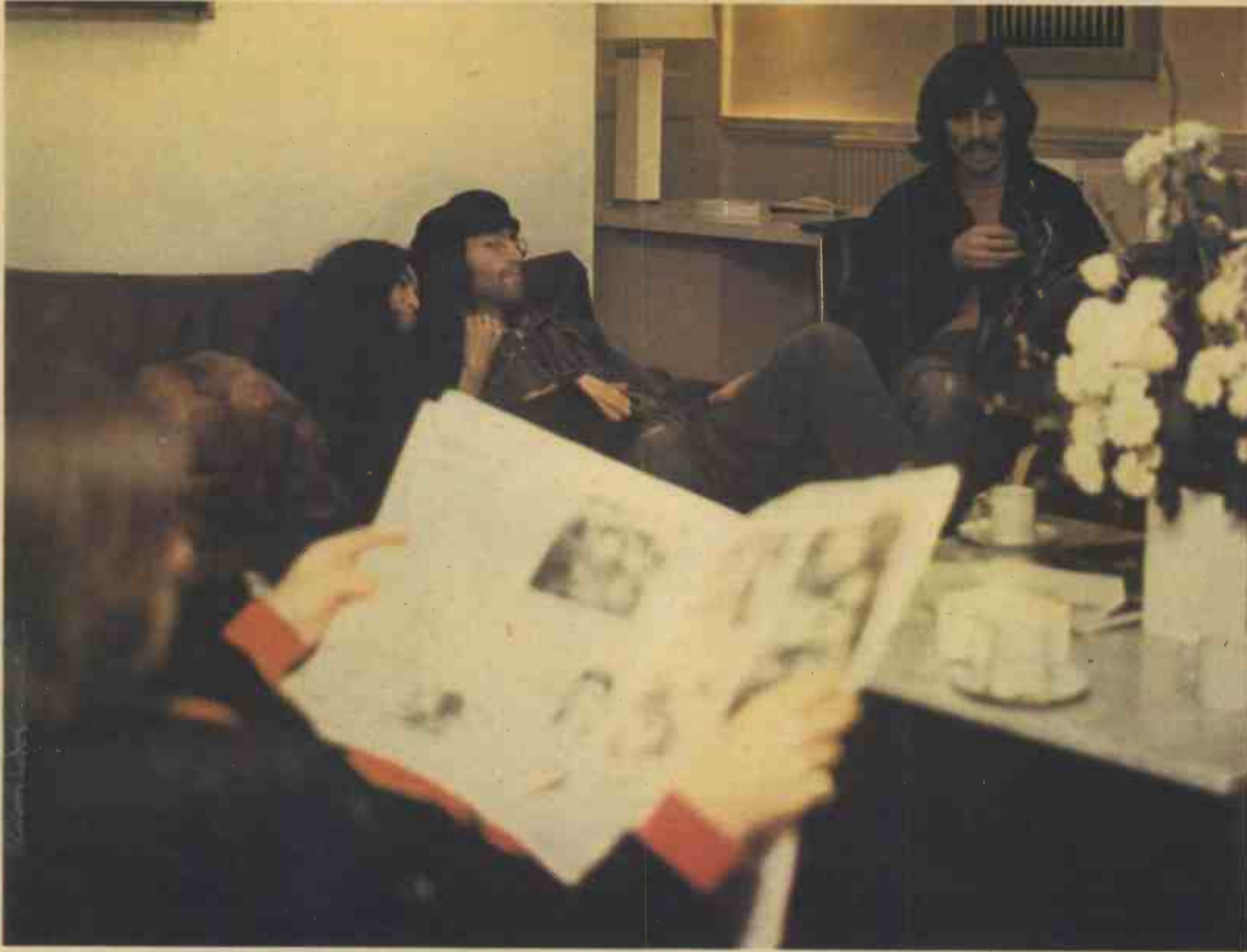
Inside Apple—GEORGE, JOHN, YOKO and RINGO in the foreground.