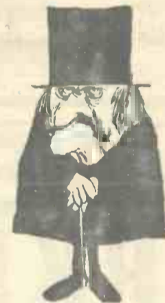
Phil Spector's advertising gimmick. Used in all his trade mag ads he says it contrasts well with other ads! He drew it himself.

Ronettes could be very big here in Britain. I don't know why my artistes should be so big here when generally American discs are really out, but I think I'm tuning in more to British tastes now—that's why I'm withdrawing the Crystals "Little Boy," because I don't think it is suitable for the market here" (see last week's story in R.M.).