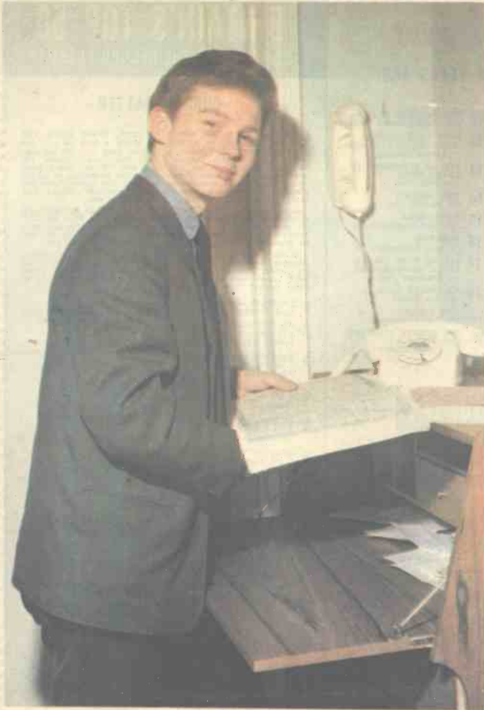
JOHN McNALLY, one of the founder-members of the group.