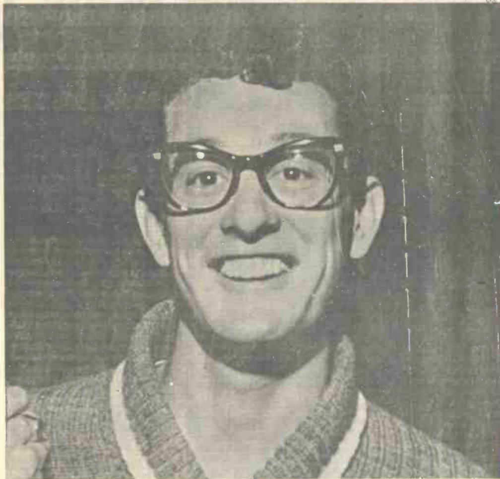
BUDDY HOLLY. There are still some eleven tracks due to be issued by Norman Petty — all of them superb well-produced numbers. The tapes are already in Britain and should be issued soon.

Buddy's manager Norman Petty so far has still some tracks to release. We have no doubt he will give Buddy's fans the best deal possible — as he always has done. And between them, Norman Petty, the millions of Buddy Holly fans all over the world and all Buddy's friends and relations have showed the world that Buddy was one of the greatest musical talents that ever lived. A man who rose above any petty fad or craze to produce some of the greatest pop records in the world, and a host of faithful fans who will be his fans until the day they die.