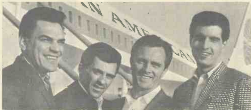
THE FOUR SEASONS