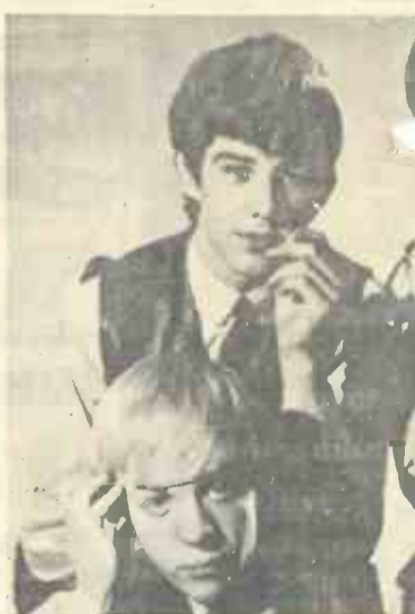
THE PARAMOUNTS, hit rec some intelligent

"He's STILL bringing out records?" and/or "He's great. Such a pity..." And there are the faithful fans who will