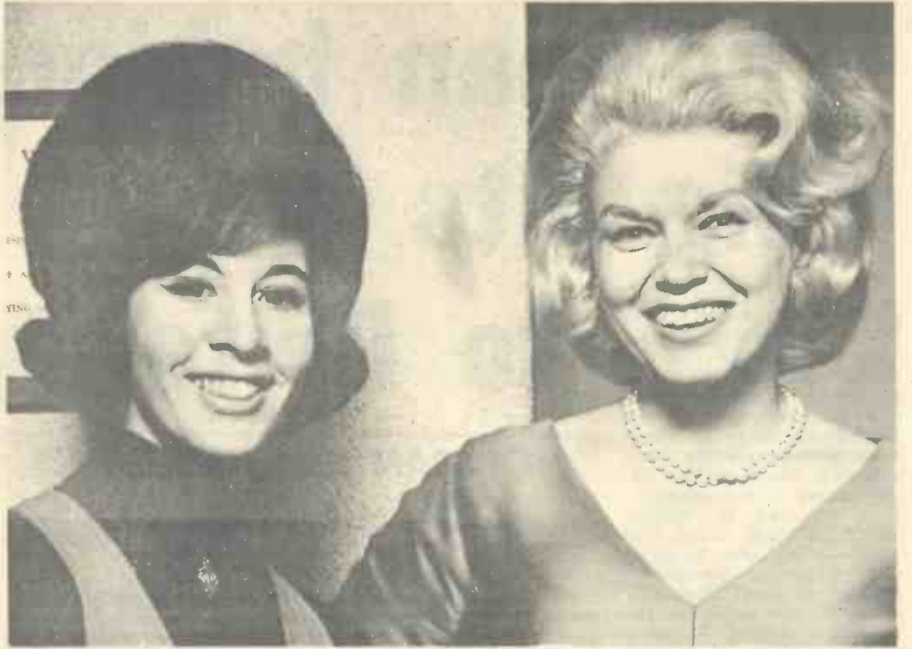
HELEN SHAPIRO AND JANE MORGAN, two popular songstresses from two separate age groups. Jane appeared in last week's Palladium show.

Something few people outside Newcastle realise is that Helen recently made her cabaret debut... at the plush Dolce Vita, there. She went on around midnight, sang for 45 minutes each night—her longest act yet. And she admits: "I was very