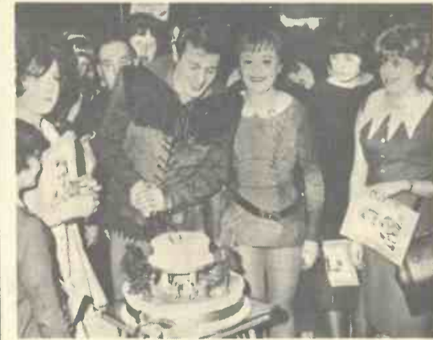
MARK WYNTER celebrates his twenty-first birthday backstage on Sunday.

HEADQUARTER & GENERAL SUPPLIES LTD. (Dept. RCM/4), 196-200 Coldharbour Lane, London, S.E.5 (Wed. 1). Also 37/39 High Holborn & 267/269 Oxford St. (Thur. 1). All open 6 p.m. Sat., Fri. 7 p.m.