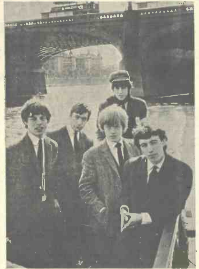
THE ROLLING STONES on the Thames.