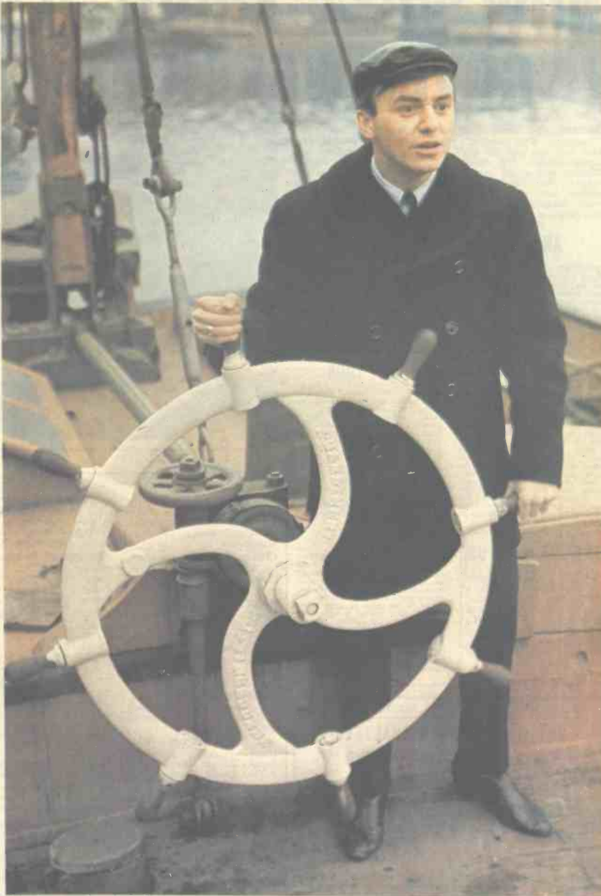
GERRY without the Pacemakers. He certainly looks as though he's having a whale of a time here. He's also well up the charts with his latest