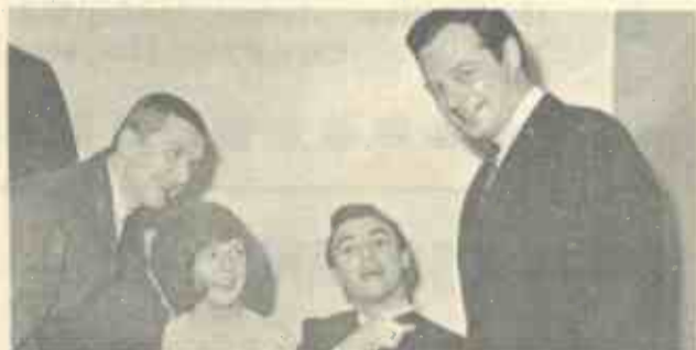
From left to right—Tony Warren, scriptwriter, Cilla Black, Gerry and Brian Epstein.

BRIAN EPSTEIN , enthusiastic and energetic brain behind the powerful NEMS Enterprises concern, announced exciting plans for Gerry and the Pacemakers on Monday of this week.