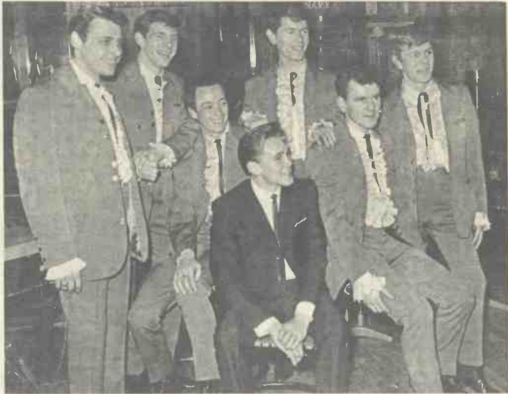
BILLY FURY seen with his new backing group THE GAMBLERS.

BILLY FURY emerged from the gloom, and brushed away a jungle-creeper, paused reflectively as two alligators swam a jaw-snapping course through a stream. A parakeet let out a shriek of anguish. A monkey chattered incessantly.