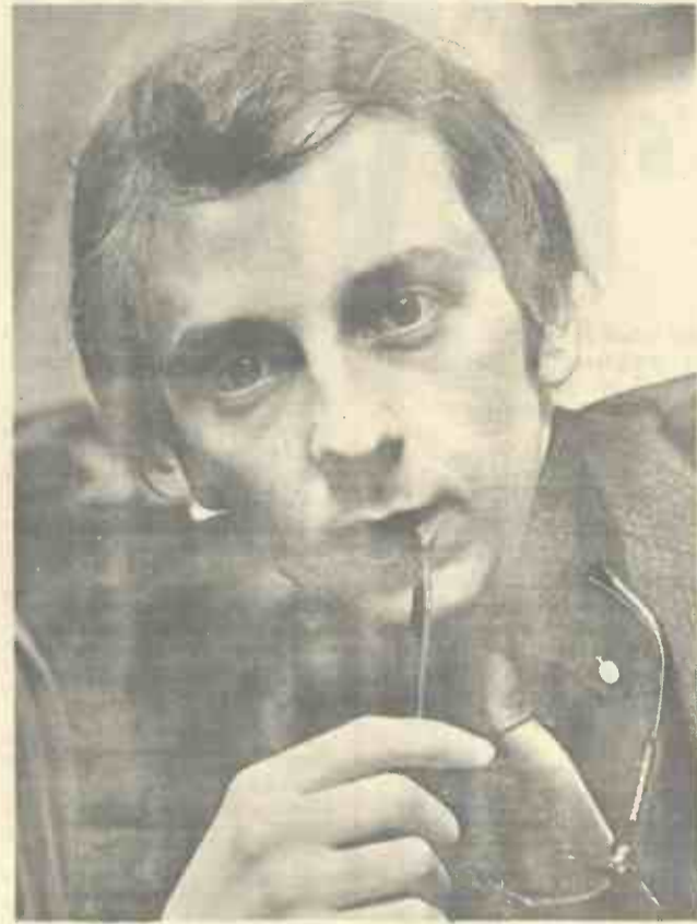
PHIL SPECTOR, arranger, producer, writer and owner of the Philles label, which created the so-called sound.

"Sometimes I use little off-beat gimmicks on my discs. Like three pianos, or just