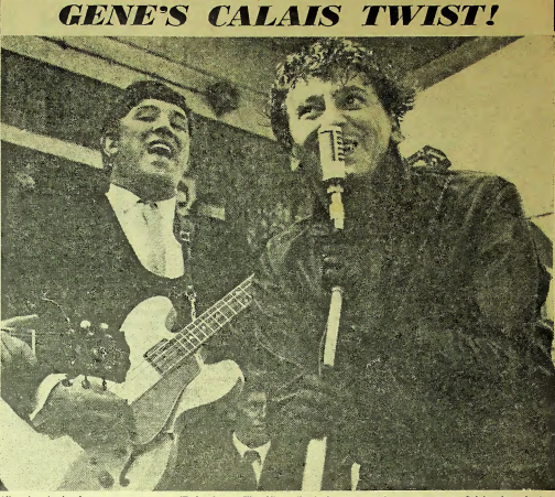
NEW RECORD MIRROR, Week-ending June 23, 1962