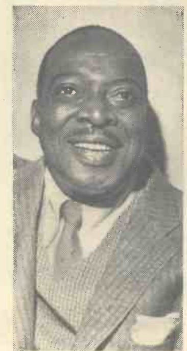
COUNT BASIE, the perilous game

attractions of total recall. "9.20 Special", "Jive at Five", "Blue and Sentimental" reveal themselves as themes with a genuine strength which has survived a musical revolution and a complete change in jazz styles.