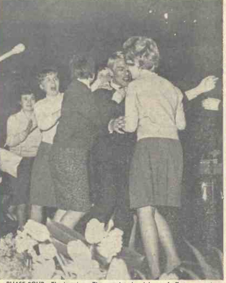
PHASE FOUR—The invasion. The complete breakdown of off-stage security as a wave of girls crash through to encircle Adam. No smiles from him now. He's used to this kind of treatment, but usually it's off-stage, at the theatre entrance.