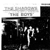
THE SHADOWS Columbia SEG8193