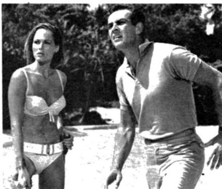
Ursula Andress and Sean Connery in a scene from the exciting "Dr. No".