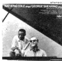
NAT KING COLE Capitol W-1675 *SW-1675