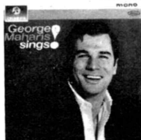
GEORGE MAHARIS Columbia 33SX1444 *SCX3450