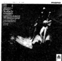
HANK WILLIAMS MGM-C-893