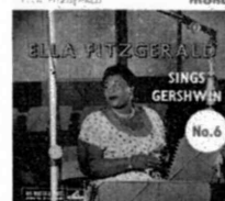
ELLA FITZGERALD H.M.V. 7EG8758