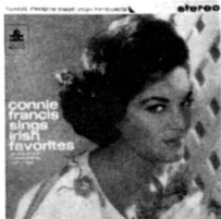
CONNIE FRANCIS MGM-C-898 *CS-6056