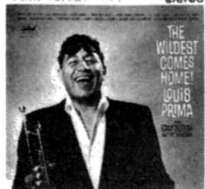
LOUIS PRIMA Capitol T-1723 *ST-1723