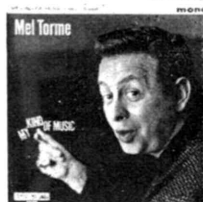
MEL TORME H.M.V. CLP1584 *CSD1442