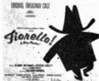
FIORELLO Capitol W-1321 *SW-1321