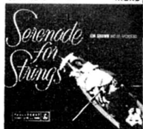
RON GOODWIN Parlophone GEP8863