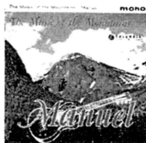
MANUEL Columbia SEG8187