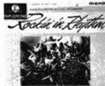
DUKE ELLINGTON & HIS ORCHESTRA Parlophone PMC1184