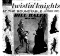
BILL HALEY Columbia 33SX1460