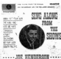
JOE HENDERSON Parlophone PMC1182 *PCS3032