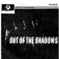
THE SHADOWS Columbia 33SX1458 *SCX3449