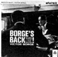
VICTOR BORGE MGM-C-897 *CS-6055