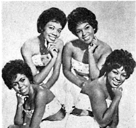
THE SHIRELLES Welcome Home Baby/Mama, Here Comes the Bride STATESIDE 45SS-119