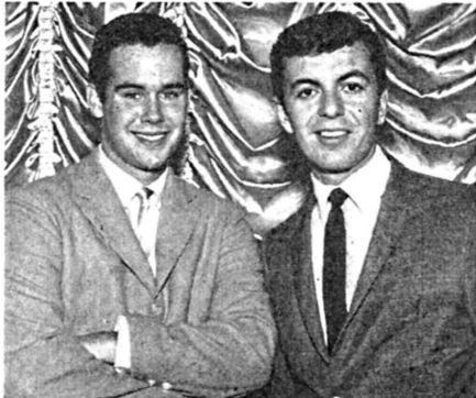
AMERICAN stars Buzz Clifford and Dion are pictured together at a reception held for them by E.M.I. Records at their Manchester Square, London, headquarters.