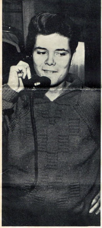
recording star to be found in this edition of Record Mail. out for them — they were the teenagers' choice.