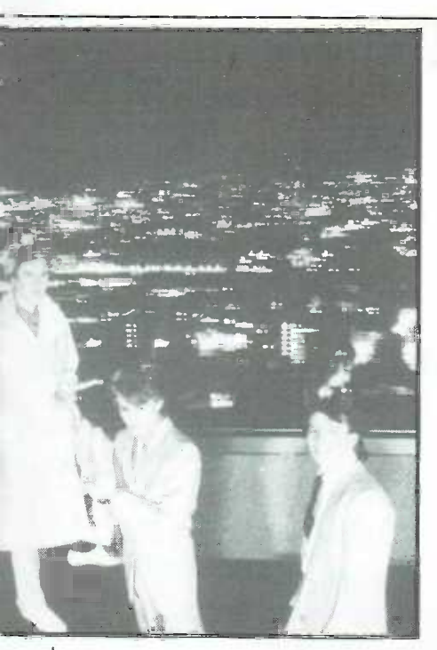
Video is important for Duran Duran (above) who appeal via cable TV in America. Below, Orchestral Manouevres In the Dark were big sellers in Europe, while Haircut 100 are one of several acts lining up to tilt at the foreign market this year.