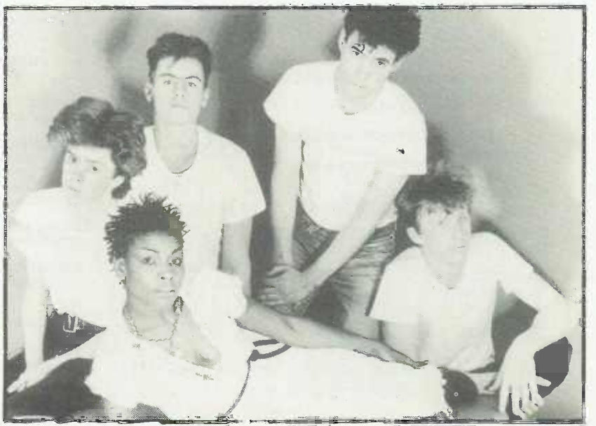
King Trigger have acquired ideas from Africa