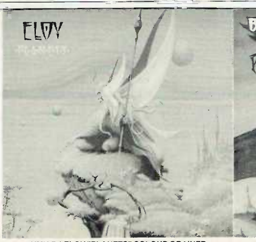
HMILP 1 ELOY "PLANETS" COLOUR GRAINED SLEEVE BY RODNEY MATTHEWS ALSO ON PIC. DISC HMIPD 1 & SONY METAL TAPE HMIMC 1