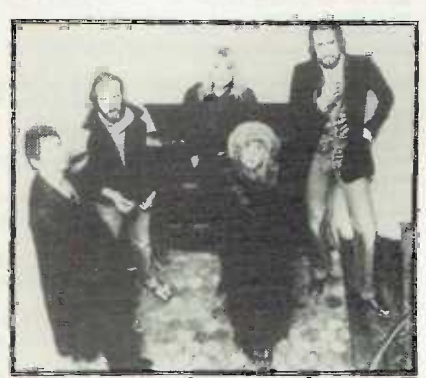
Fleetwood Mac: Top 10 success.

"Sales of records may have dropped but I do not believe that interest in