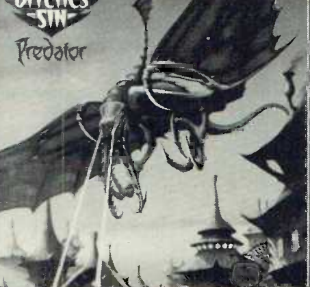
HMR LP 4 BITCHES SIN "PREDATOR" COLOUR GRAINED SLEEVE BY RODNEY MATTHEWS