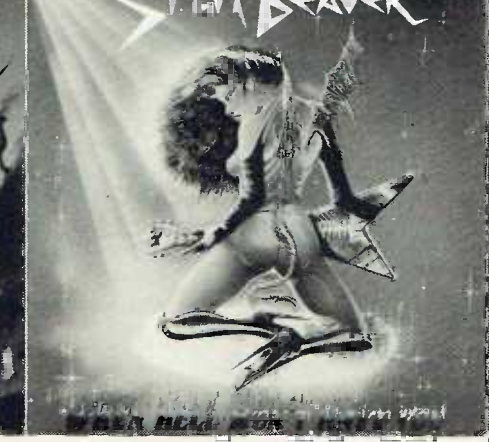
HMR LP 3 SPLIT BEAVER "WHEN HELL WON'T HAVE YOU" COLOUR-GRAINED SLEEVE.