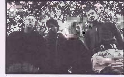
Five Or Six: Cherry Red debut