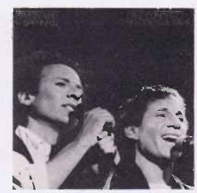
The Concert Live In Central Park Geffen 96008 40/96008

Greatest Hits CBS 69003 40/69003 Bridge Over Troubled Waters CBS 63699 40/63699 Wednesday Morning 3 a.m. Bookends CBS 63101 40/63101