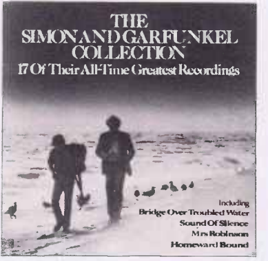
Simon & Garfunkel Collection CBS 10029 40/10029

We'll be keeping Simon & Garfunkel on everyone's mind with a massive back catalogue push, featuring 6 of their greatest albums. National press ads are scheduled for both before and after the concert and the TV Special. Point of sale will keep the customers satisfied in-store.