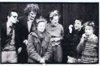
'Dole Age' single while all - acoustic band Scream and Dance has its debut single out this week.