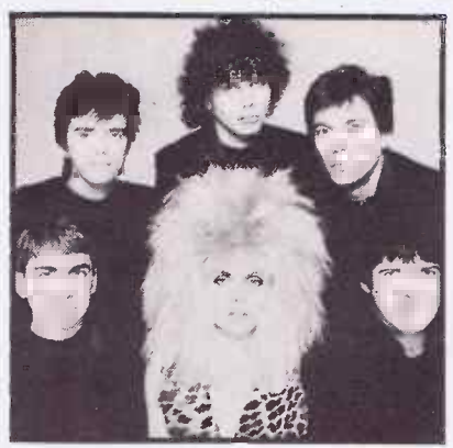
Blondie: lyrically strong.