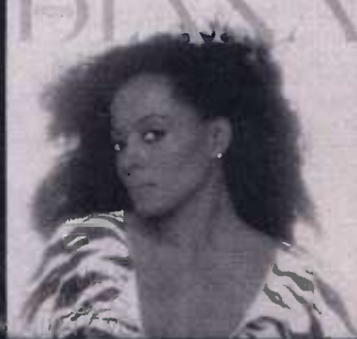
SINGLE TAKEN FROM THE ALBUM AND CASSETTE WHY DO FOOLS FALL IN LOVE EST 26733