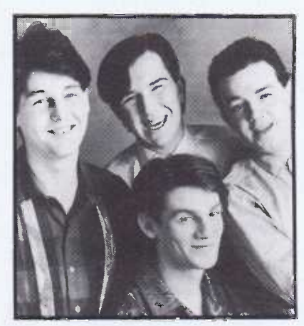
Endgames: good dance music-