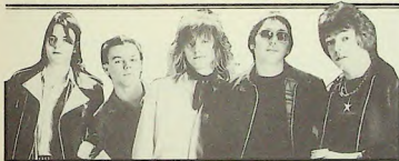
EDDIE AND the Hot Rods: cleaner sound

AFTER SCORING a modest hit with their 'Sound Of The Suburbs' single, The Members have been recording tracks for a debut album released in March on Virgin. At that time they will also undertake a nationwide tour.