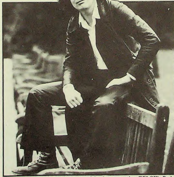
TOP: Eddie Money's mediocre material a bar to stardom; BELOW: Rod Argent's doodlings uneasy with jazz-rock.