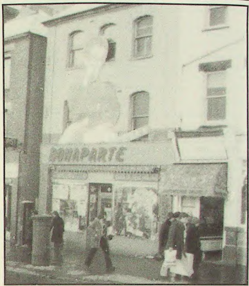
BONAPARTE in Croydon: plans for a move to Central London

Despite the diminishing emphasis on the retail side of the business, Bonapartes reputation as a record dealer remains as high as ever. It continues to be one of the few outlets that consumers can be fairly