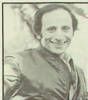
HENRI BELOLO: "Village People are for everybody."

"We started the whole disco phenomenon in 1974 in Phillie. We had in mind to record a disco version of 'Brazil', so we formed a band called The Ritchie Family for the occasion and gave