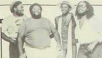
INNER CIRCLE: extra dates with Average White Band

VARIOUS: Hottest Hits (Front Line FL1034)