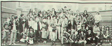
ON THE steps to success? In Talgarth Square last week, 17 bands celebrated their signing to newly launched ROK Records (owned by The Label Records). They are bands who have built a strong regional following and they will be featured on a series of singles to be released from February 23.