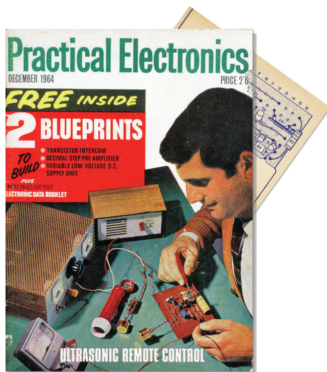
The December 1964 edition encouraged hobbyists to use the new British-designed 'Veroboard System' to assemble circuits

Printed circuit board foils were offered right from the start, with cellulose paint recommended as etch resist and a fearsome cocktail of ferric chloride and hydrochloric acid suggested for etching boards at home. Mercifully, stripboard assembly quickly followed in Practical Electronics , with December 1964's issue already having a pull-out blueprint featuring two projects using the new 0.15-inch pitch 'Veroboard System'. This SRBP circuit panel of milled copper strips and a precision matrix of punched holes was a truly brilliant invention, which had launched earlier in 1961, and Veroboard was destined to put home electronics construction within easy reach of hobbyists for decades to come. Readers faithfully followed the magazine's skilfully drawn assembly diagrams and soldered everything together with gusto.