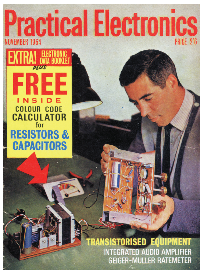
The very first issue of Practical Electronics arrived in 1964. It was packed with features and mail order advertisements