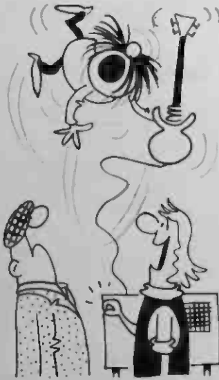
"I'm all for incorporating it in The Act but he objects!"