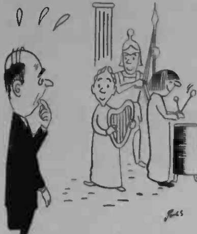
"What do you think of our new image?"