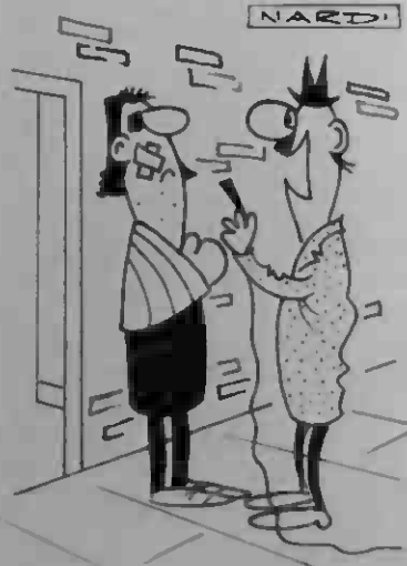
"Would you like to tell listeners about your latest Hit?"