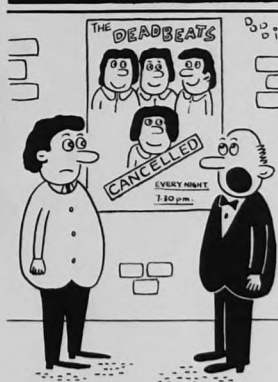
"It's not that we couldn't afford them, it's the electricity bill we couldn't meet!"