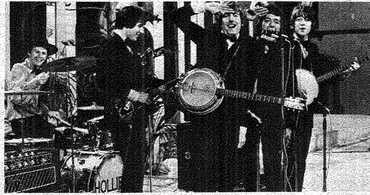
Straight from their successful appearance at the Split, Yugoslavia, Pop Festival — where this picture was taken — the HOLLIES opened on Monday at Batley, marking their debut in cabaret. (L to R) BOBBY ELLIOTT, BERN CALVERT, GRAHAM NASH, ALLAN CLARKE and TONY HICKS. See review below, right.