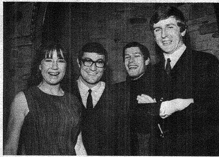
The SEEKERS, at the height of their popularity when they recorded "Georgy Girl" (1 to r) JUDITH DURHAM, ATHOL GUY, KEITH POTGER and BRUCE WOODLEY.

DEAN MARTIN: April Again (Reprise). One of these days, Dean Martin's going to drop off to sleep in the middle of a recording session—he sounds halfway there on this disc. Accompanied only by guitar and flute, it's both charming and captivating— as well as nostalgic. But not chart material. Self-penned.