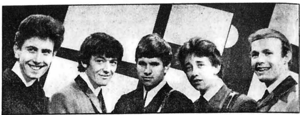
GRAHAM NASH • ALLAN CLARKE • ERIC HAYDOCK • TONY HICKS • BOBBY ELLIOTT

produced by andrew loog oldham for impact sound