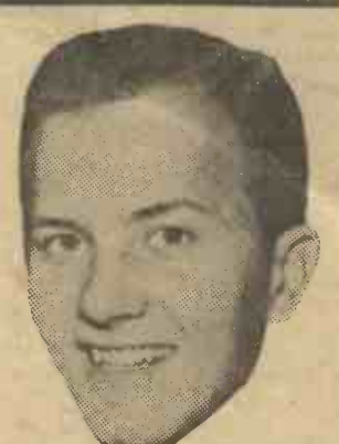
PAT BOONE presented a polished act as Palladium TV star.