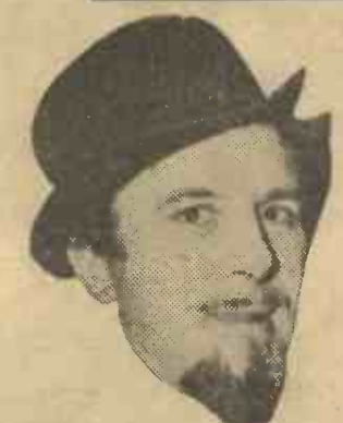
ACKER BILK Gold Disc presentation for "Stranger On The Shore."