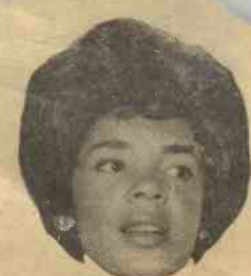
SHIRLEY BASSEY . . . great Palladium variety debut