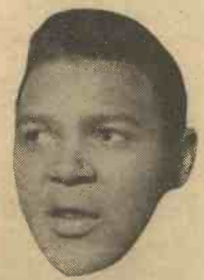
CHUBBY CHECKER continues to occupy two chart places with twist hits.