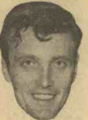
JET HARRIS . . . ex-Shadow, has first solo disc released this week.