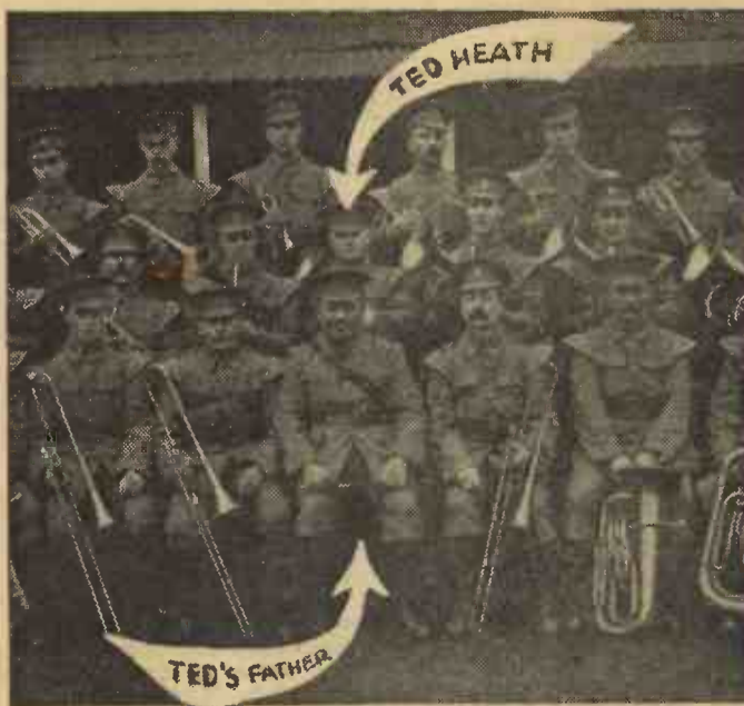
Father and son in the Band of the 14th Battalion County of London Volunteer Regiment, 1917.