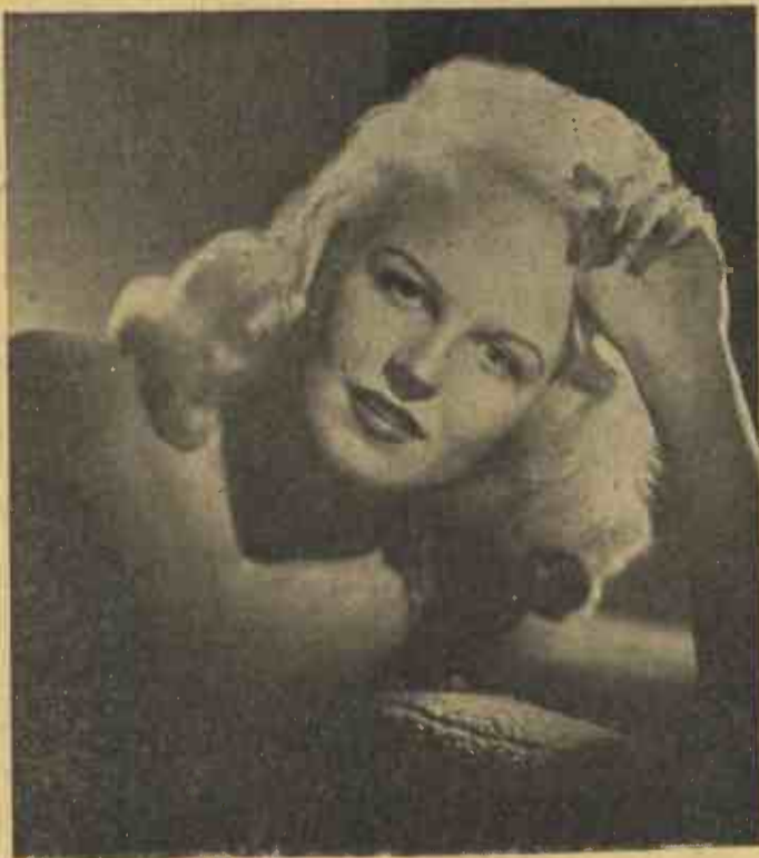
Glamorous Peggy Lee, who has sung her way into the Best-Vocal-Disc-of-the-Week spot.

Parker's improvisations are near enough on the basic chords of a tune, altered, of course, to suit himself, but never so much that the melody and chords of the tune are completely submerged. Konitz, however, takes the thing a step further, by superimposing yet another