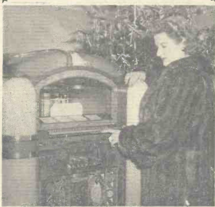
Anne Shelton hears her own voice on one of the juke boxes at Dublin's Coconut Grove after her highly successful concert in Dublin.