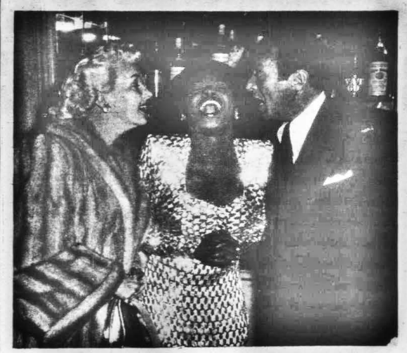
Singing Star Sarah Vaughan enjoys a laugh with screen star Betty Grable and Harry Ritz of the famous Ritz Brothers during her recent record-breaking engagement at Ciro's in Hollywood...