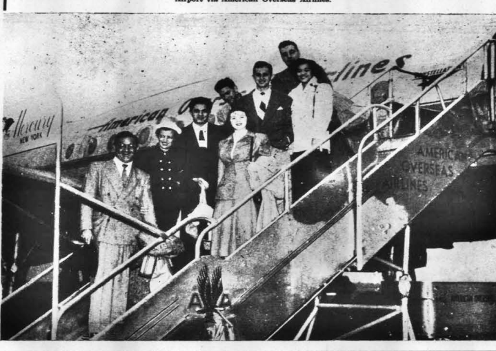
Exclusive picture of the great maestro-clarinetist and Mrs. Goodman, with their entourage, arriving at Heathrow Airport via American Overseas Airlines.