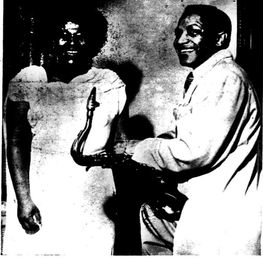
Illinois Jaquet, former Court Basic tenor stylist, is one of the biggest box office attractions in the American jazz world these days. This latest special photo for "Musical Express" shows him with Ella Fitzgerald, with whom he has scored most of his major concert triumphs.

At the beginning of August we shall be hearing the addresses and Election Programmes of the candidates for General Secretary of the Musicians' Union. Make no mistake about the issue, for it concerns YOU as nothing else in music ever has.