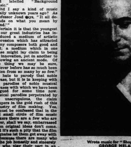
Wrote music for "Shop at Sly Corner" GEORGE MELACHRINO