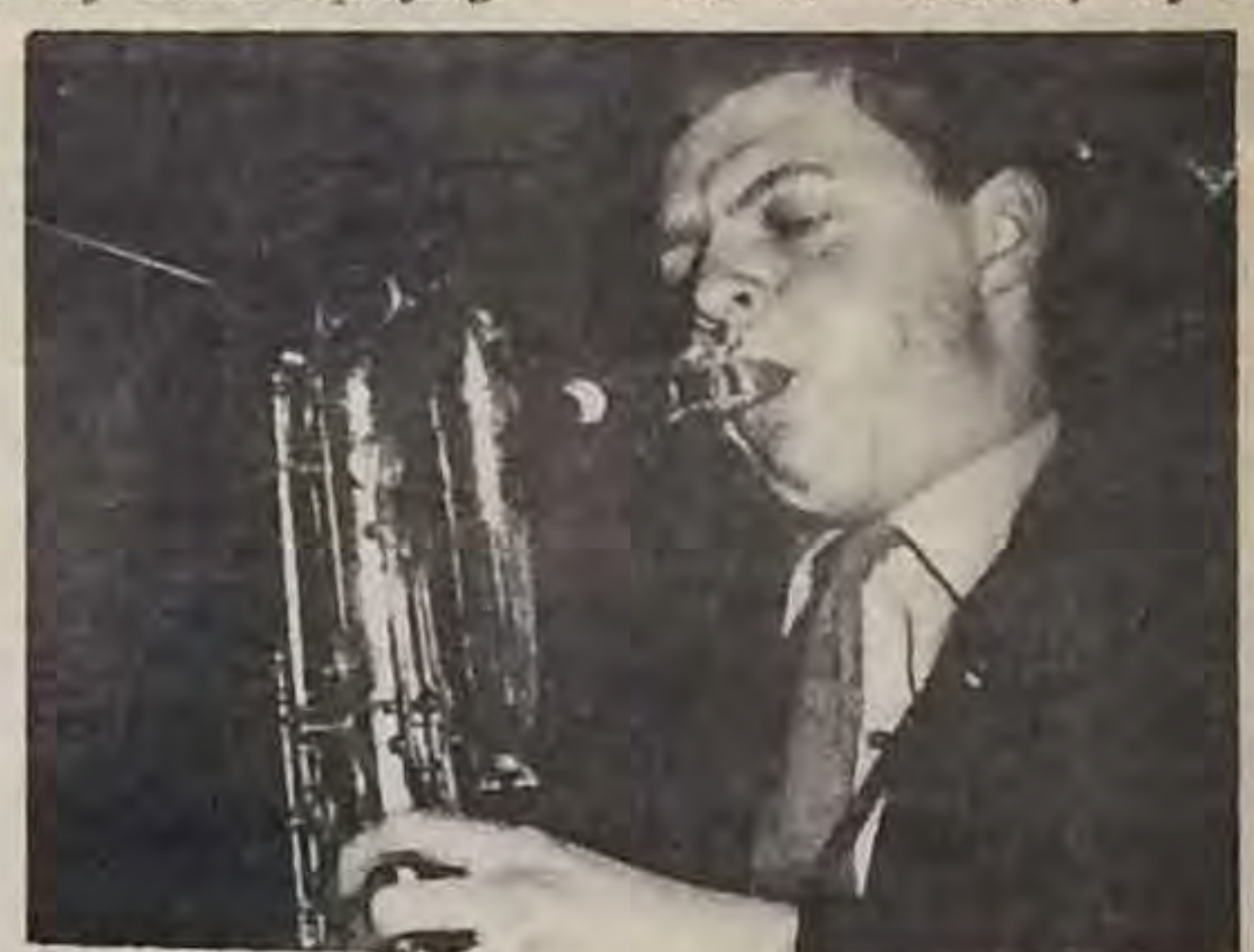
SURMAN: being creative is a full-time job.

Taking part in performances of "Treatise," by Cor-