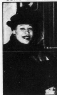
Nellie Lutcher, snapped at Waterloo Station, where she embarked on the first stage of her return to the U.S.