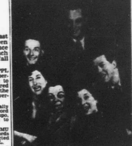
The musical team that weekly heralds in the 'Daily Mail' National Radio Award winning series, 'Educating Archie', is here seen with the 'star' himself, The Hedley Ward Trio comprising...