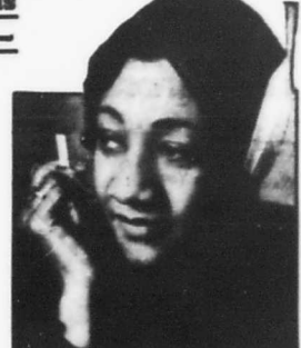
☆ Alberta Hunter ☆