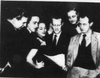
The moderate 'Stargazers' have a lively spot in each week's edition of the 'Calling All Forces' ...