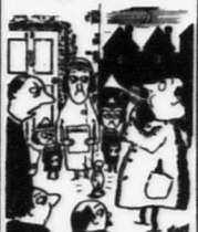
'Could we concentrate on King Wendell's right now, Mr. Grumpy - and save Harry James for the Church Dance tomorrow night?'