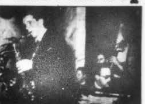
Columbia's new personnel booklet