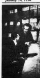
Josh White and son on Broadway from 'M' New York Correspondent LEONARD FEATHER