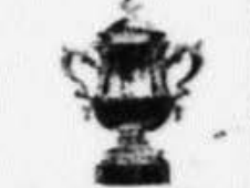
Showing a short photo

The new programme is planned to be very varied, ranging from the classical to the modern, and including the most popular songs of the day.