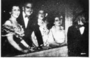
... TWENTY-FOUR HOURS TOO SOON!