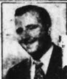
Showing a short photo

The Duke Ellington Quintet, the Charlie Ventura Sextet, the George Shearing Quintet, and the Duke Ellington Quintet.