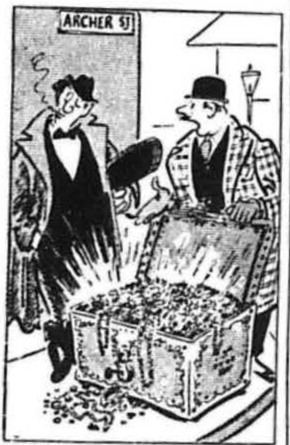
By Belts "There! Now will you consider a year's contract in the provinces?"