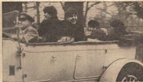
Into the car and one fan makes a dream come true.