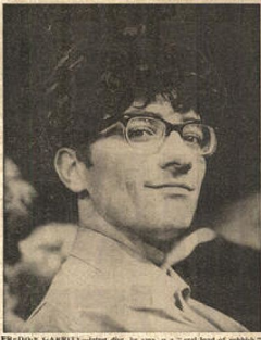
FREDDIE GARRITY—latest disc, he says, is a "real load of rubbish."