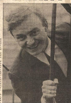
trunk appeared by the boys who work and play with him.