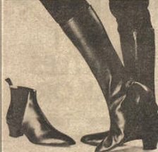
Men's Styles: BABA (left) with either a 2 or 3 1/2" heel: in black, brown, blue or green leather—£15.98, plus 3s. 6d. for postage and packing.