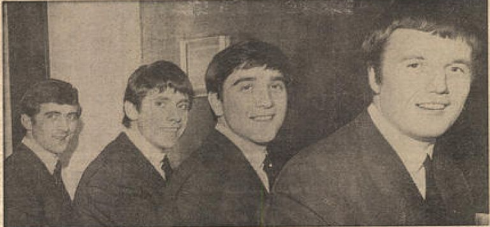
THE SWINGING BLUE JEANS—Only one wears jeans very often at stage!