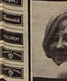
The Decca Record Company Limited, Decca House, Abchurch Lane, London, E.C.4