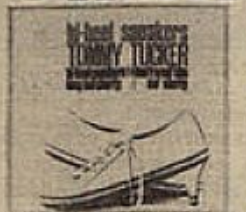
NO-HEEL SNEAKERS—TOMMY TUCKER No-heel Sneakers/Don't Want You/Long Tall Shorty/My Heart P.E.P. NEP 3011