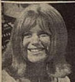
MARIANNE FAITHFULL—Big jump to 12