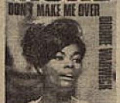
DON'T MAKE ME OVER—DIONNE WARWICK Don't Make Me Over/That's The Way That I Feel/You'll Never Know/My Heart/My Heart/My Heart P.E.P. NEP 3010