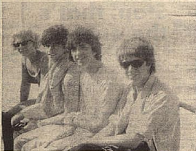
Johnny Gustafson, Tony Crane and John Banks relax by the sea as Aaron snaps them.