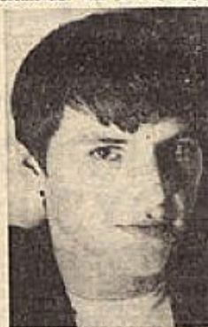
ALAN PRICE — Procession into New York.

I haven't decided on anything particular that I want to bring back — just anything that takes my fancy and that is particularly American... and small enough to put in my case! Like the Statue of Liberty, for instance!