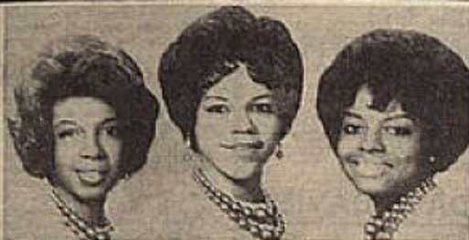
THE SUPREMES—First record here on Stateside looks like being a big hit.

NUMBER ONE in America, and now they've come crashing into our Thirty with their first release here, "Where Did Our Love Go" just a few days after release.