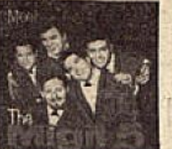
MEET THE MIGIL 5—MIGIL 5 Meet The Migil 5/Meet The Migil 5/Meet The Migil 5/Meet The Migil 5 P.E.P. NEP 3015