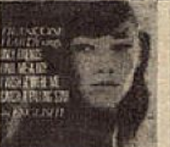
FRANCOISE HARDY SINGS IN ENGLISH I'd Like to Be With You/It's Wonderful/It's Wonderful/It's Wonderful P.E.P. NEP 3013