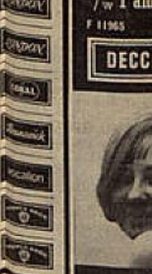
The Decca Record Company Limited, Decca House, Abchurch Lane, London, E.C.4