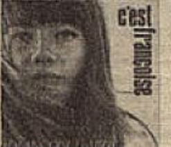
C'EST FRANCOISE—FRANCOISE HARDY C'est Francoise/Jeune Fille/Jeune Fille/Jeune Fille/Jeune Fille P.E.P. NEP 3012