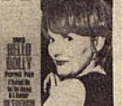
PETULA CLARK SINGS HELLO DOLLY Hello Dolly/Hello Dolly/Hello Dolly/Hello Dolly P.E.P. NEP 3014