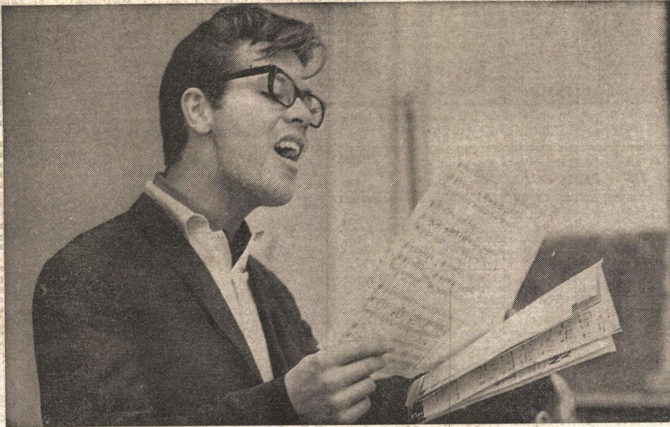
CLIFF swings his way through "Tulsa," one of the "other people's hits" he will be doing on the tour.