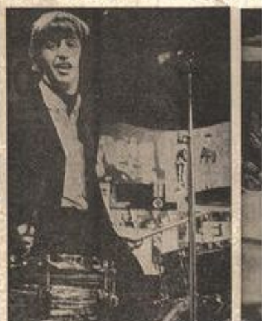
ranks of commissionaires. And the fans themselves were as eager as A-R TV executives that this "Ready Steady Go" should go off without a hitch.