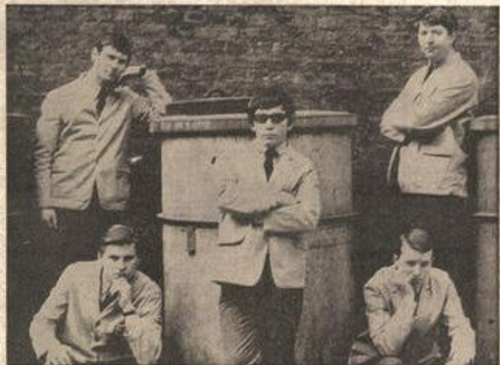
THE ANIMALS—this Newcastle group's debut gets a D.N.T. And they wrote the "A" side themselves.

T HREE duets from the Rodgers and Hammerstein score for "South Pacific" and Cole Porter's