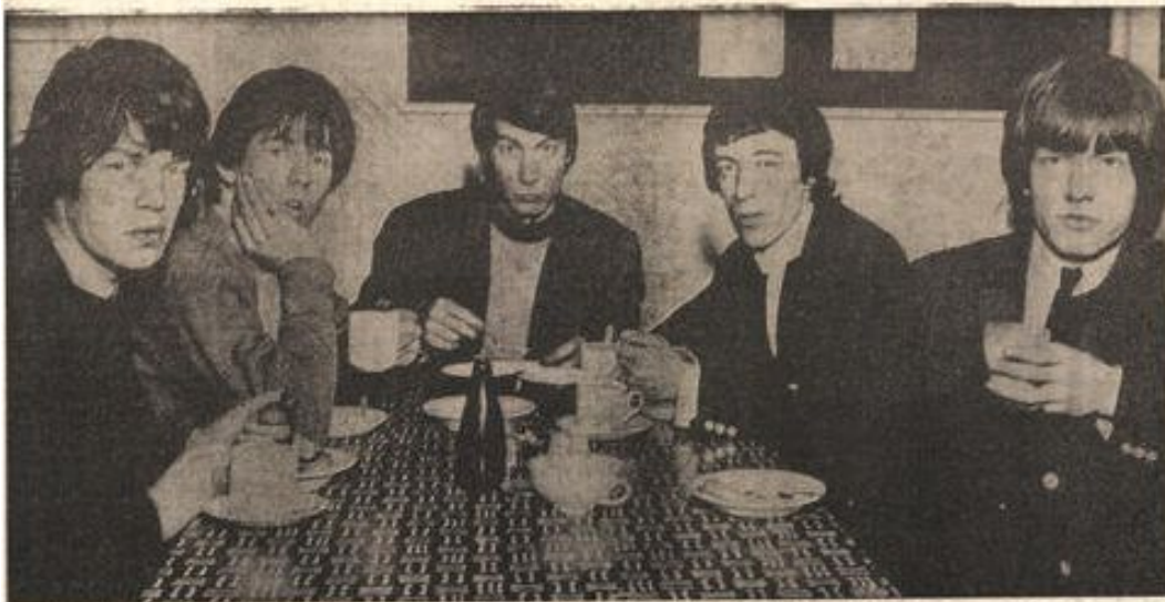
Mick... Keith... Charlie... Bill... Brian