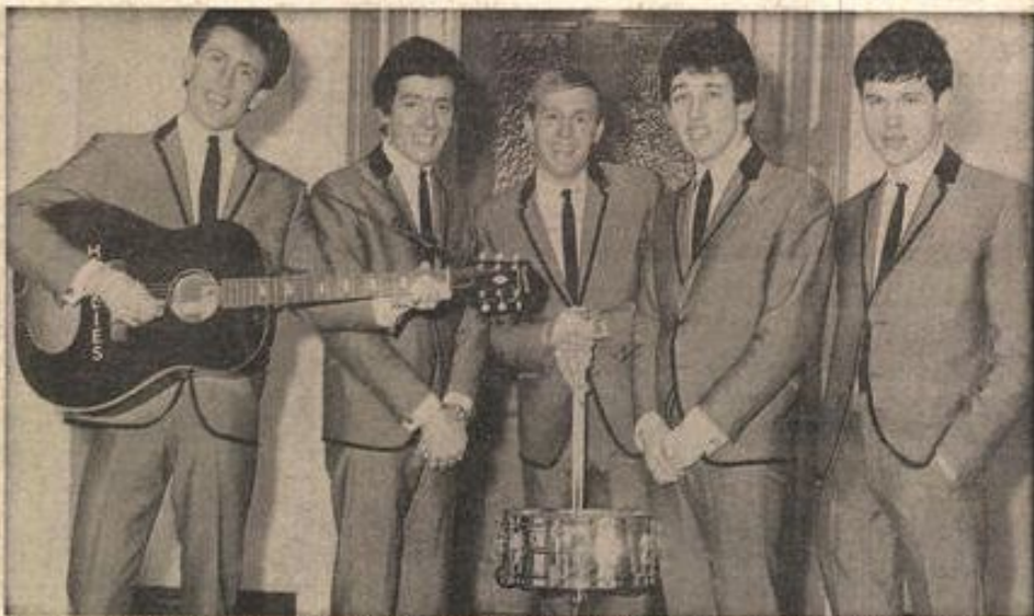
THE HOLLIES—they liked "Just One Look" but were doubtful about its hit parade chances. Now it's at No. 3 in the charts

My latest single release "I'm On Fire" is now going like the proverbial forest blaze, and when I left the States a few days ago my LP "Golden Hits Of Jerry Lee Lewis" had already sold over 70,000 in three weeks. The way it is going it could well top the 200,000 mark!