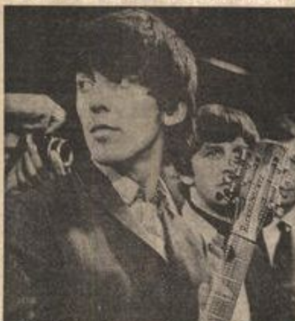
Achievement Award for snatching the top three places in "Billboard's" Hot Hundred. But by this time, those three places had jumped to four.