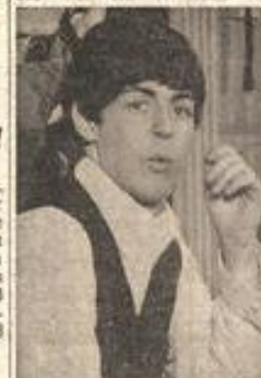
PAUL McCARTNEY—Great film number.

● Cliff Richard's version of Kathy Kirby's "Secret Love" on US LP "It's All In The Game" ... "Mockingbird" (Soul).