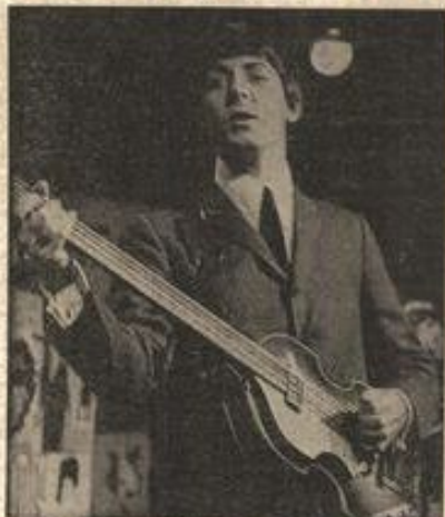
Paul McCartney, the rehearsal went off as smoothly as clockwork as The Beatles delivered "I Won't Be Long," "You Can't Do That" and "Can't Buy Me Love."

Despite the photographers, the pressmen and the studio