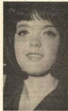
BILLIE DAVIS—Rocking's a bit too strong.

B ILL SIMPSON is no doubt a much better known throughout Britain as a star of TV's "Dr. Finlay's Casebook." On this disc, he doesn't sing the old Nat Cole hit I Love You For Sentimental Reasons. Instead, he takes the lyric in his best Scots voice and manages to make it sound in character, too. I prefer the fine Scott lines on the other side and Simpson speaks the famous poem with an insight, that once or twice set a shiver down my spine. Silen? Deponda entirely on how many fans can tear themselves away from the sets.