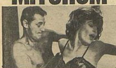
Was he guilty of that drug crack? Is he really such a hard-boiled tough guy? READ BOB MITCHUM'S own frank comments on his fascinating life—from chain gang convict to international film star—at a page of his latest film—the toughest part he's ever played.