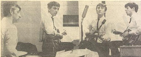
THE BEATLES — Coming great excitement in Liverpool, but can they do the same in the rest of the nation?