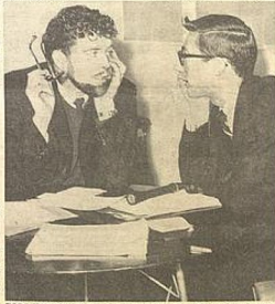
CLIFF RICHARD , who has just won his first Silver Disc for "Sun Arise" (see below), is seen here with HANK MARVIN of the Shadows , an old hand where these awards are concerned.

Bedford Grande on March 12 has been added to the Chris Montez tour.