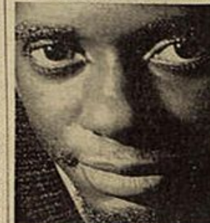
BOBBY TIMMONS — In line form, after that opening night!

Lee Morgan sounded better and better—a phenomenal trumpeter. And Bobby Timmons, after that unfortunate opening concert, proved that he should never be typed as a "soul" jazzman. He, like Lee and Wayne, is a brilliant musician, and there is more originality and inventiveness, and looking ahead in the Messengers' music now than at any time in their seven-year existence.