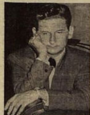
ROY ORBISON—Dramatic, pounding. Western-type ballad.

The standard "The Touch Of Your Lips" gets an intriguing ballad reading from Della. A romantic ball which yet has tremendous power. Ellington packs a bank of strings behind the singer.