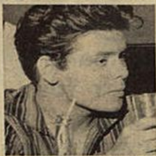
CLIFF RICHARD—Not keen on the German star.

THE search for Cliff Richard's leading lady in his new film "The Young Ones" has run into trouble. No one has yet been found suitable for the part of the young girl who meets Cliff in a youth club where he entertains, and already the film is more than a week behind schedule.