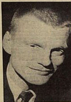
GERRY MULLIGAN—A very fine five-star album.

In contrast, the ballads ( What Is There To Say , the gently grooving Every Time and It Could Happen ) get generally brooding and sombre