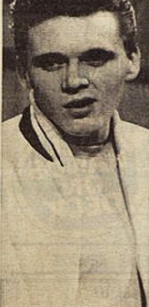
* BILLY FURY . . . "Don't let them do it to you."

The slybit tip is usually like a worn out bull bearing and consequently