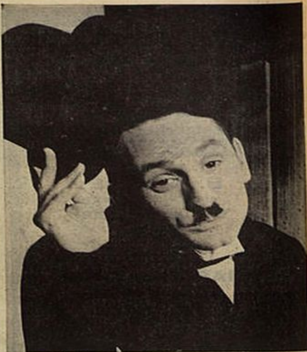
Lonnie, alias Charlie Chaplin, as he appears in one of his new series for ATV.

Why should this news make him decide that the lush sounds are out? By Donegan's standards his last record was a flop—"Bury Me Beneath The