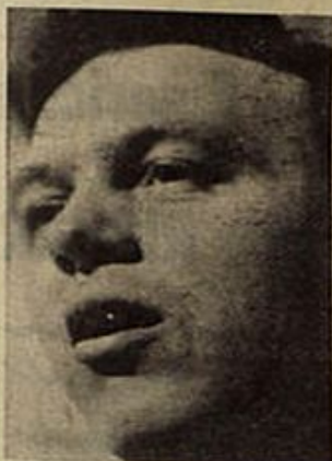
MATT MONRO — His backings are a refreshing change. See "Swinging."

Each week an LP is awarded to the writer of the Prize Letter... and once a month there is a bonus prize of a Ronson lighter/ashtray set.