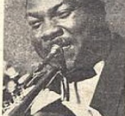
CAT ANDERSON — Excellent value and well worth buying.