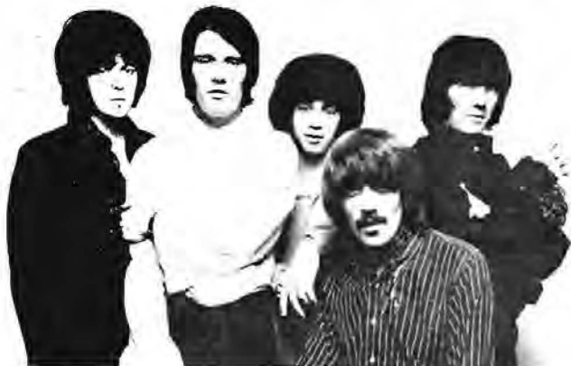
Deep Purple's new single was recorded in De Lane Lea.