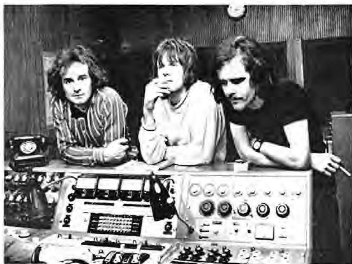
The Nice listen to a play-back of one of their new LP tracks.

Deep Purple made their new records—a single, Kentucky Woman , presently doing well in America, and an album—at the studio, and