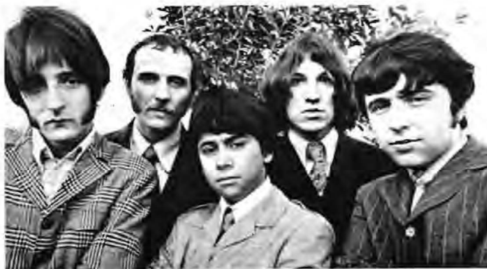
A new album from H. P. Lovecraft, titled after the group's name.