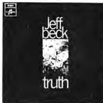
JEFF BECK COLUMBIA SCX 6293

Jeff Beck's band is another one we're in danger of taking for granted and so losing to the adulating hordes in the U.S.A. That would be a real tragedy—listen to I Ain't Superstitious , for example, and ask yourself who else could do it. Beck's guitar sings, screams, moans with his trademark rich sound, and his use of wahwah would bring tears of joy to the eyes of a statue. Rod Stewart sings magnificently, with traces of self-mockery, Nicky Hopkins does some nice piano, and the rhythm section of Ron Wood and Mick Waller produce some amazing cross-beats, never taking the obvious route. This is a truly great record.