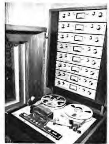
An eight-track tape machine at Pye.

We recently received a letter from Ron Pickup, a British