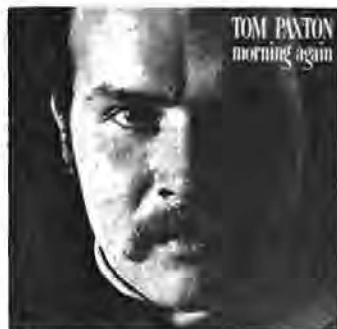
TOM PAXTON ELEKTRA EKS 74019

Gone is the Tom Paxton of old, perhaps a little bit gutless and clean-cut. This album is a real change of direction for him, and a very rewarding change at that. The smooth voice is still much the same but the subject matter is more outspoken—songs about the U.S. army in Vietnam, getting high with the fruits of "Uncle Ho's victory garden", about prostitutes—and the backing is more spiky and punchy. The album is yet another expression of disillusionment with the American dream, but it's a good deal better than most.