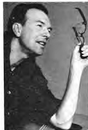
The legendary Pete Seeger—an innovator of the 12 string.

The Spanish guitar was probably an invention of the Arabs, who brought it to Europe in the Middle Ages. When the Spanish went to America, the guitar went with them, and soon became the main instrument of the Southern negroes. It could be used to accompany songs, the performer being free to sing at the same time as he played, it was easily transportable, robust and relatively cheap and