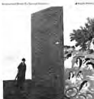
GEORGE HARRISON APPLE SPCOR 1

Apple's first album, this is a good record without being a dazzler. But then, that's what film music is supposed to be—effective within the context of the picture, but not obtrusive. It has to take second place. Viewed in this light, it would seem to be a success (though I haven't seen the film) and at the same time it's well worth a listen. Subtle and full of nice things, it's very Indian (Red Indian too) as might be expected, since it was recorded in December 67. I like it very much.