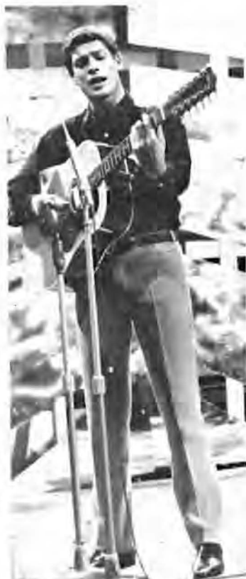
The 12 string was an important factor in the Seekers' sound.

The simple things usually come out best. The fuller sound of the guitar means that one chord will sound fine when on a six you'd have