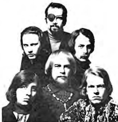
Right: Ars Nova —convey their own reality through the classics.