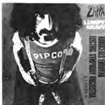
FRANK ZAPPA VERVE VLP 9223

Is it because nobody but Frank Zappa understands Frank Zappa, that his records are so astonishingly strange? Can he seriously be making records just for himself? There seems to be no apparent significance in anything he does on this LP. Example—"Where can I get sympathy?" Answer—"From your local drugstore". Then a lot of silly noises. When he's making music, he's brilliant, but it's the rest. If he's advocating anything, perhaps he should do it in a stronger voice. He has the intelligence to say what he wants to precisely, but he seems to be completely indirect, following a lot of paths to no obvious end. This album, says Zappa, started out as a ballet. I still don't understand it, and perhaps he doesn't either.