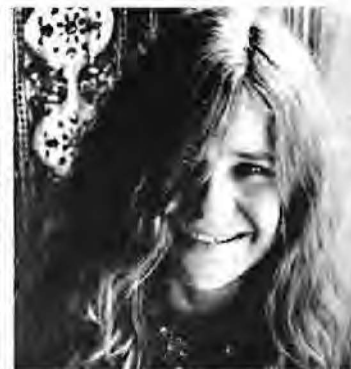
Janis Joplin's new band may make its debut on New Year's Eve.