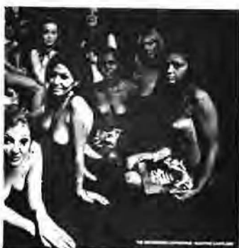
JIMI HENDRIX EXP. TRACK 613 008/9

In Billboard magazine, they called this Electric Landlady , which could be a better description of what's in the record. Jimi produced the double album himself, and it's presumably as near as he can get to a musical demonstration of himself. It's all been said before about Jimi. Of course his guitar is wonderful, of course he's full of imagination, of course Noel and Mitch are one hundred per cent behind him, of course this is a chart and artistic success. And let us not forget the cover with all those lovely ladies there upon. Saturday night at the bath house and a fine record.