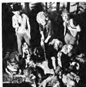
JETHRO TULL ISLAND ILP 985

It's a great pity that the flamingo-like antics of Ian Anderson cannot be pictured with this LP. It sums up the great humour and enjoyment Jethro Tull instil in their music. With the band now near total acceptance, it's pleasing to see them emerge as individuals with a lot of talent on record, as well as their vital live shows. Anderson blows a fine flute, with Mick Abrahams proving himself one of the best of the new guitarists. Their Someday The Sun Won't Shine For You sums up their music—alive and honest. I'm glad the public see that too.