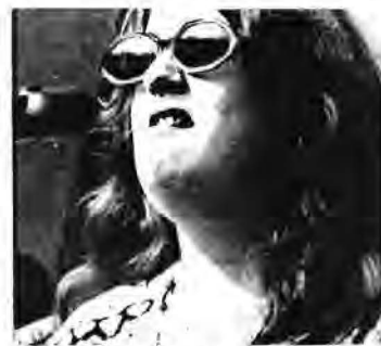
Mama Cass avoids law suit by singing solo.