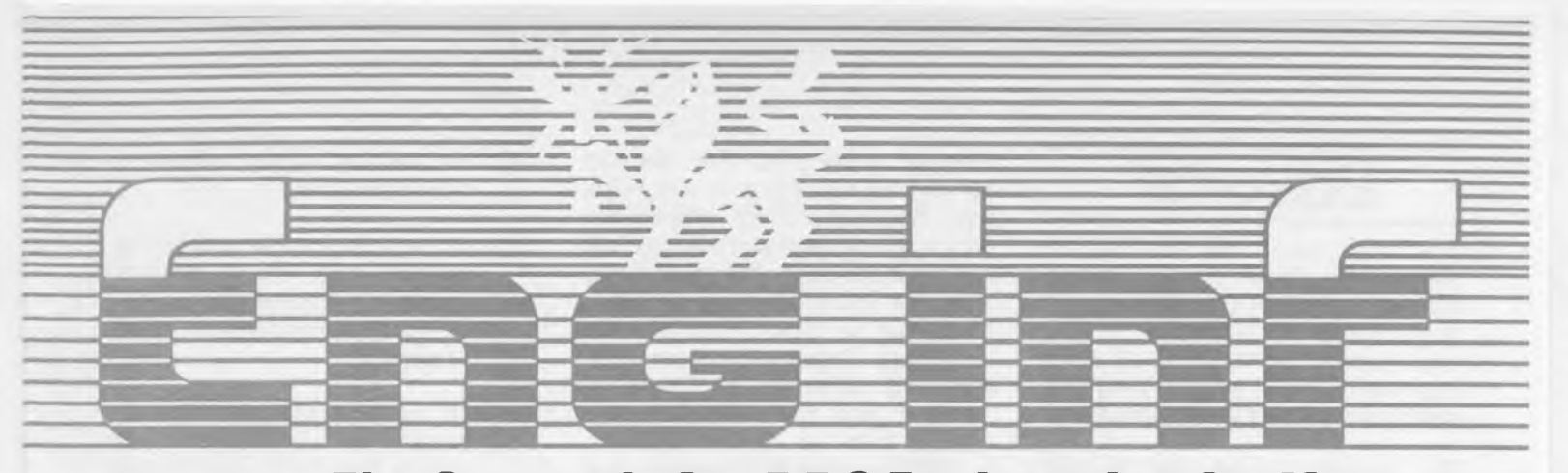
No. 14 - Autumn 1983 The Quarterly for BBC Engineering Staff Please circulate