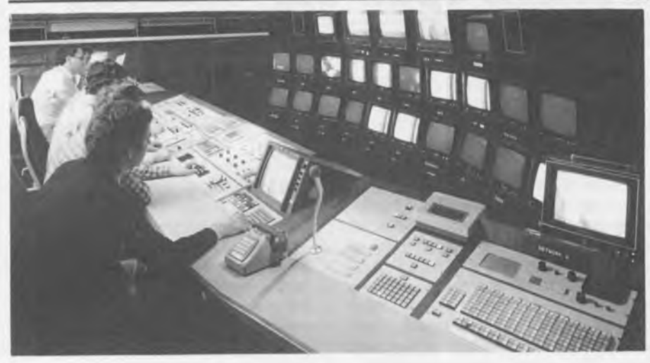
Studio 4 production control room. Engineering staff test the new mixing desk and special effects units

Television Centre Studio TC4 returned to service on the 12th September after an extensive refurbishment costing some £2M. The studio first entered service in 1961 as an image-orthicon camera monochrome studio, concentrating on drama and light entertainment. It was later converted to multistandard (405/625 line) operation and was completely equipped for colour operation in 1970.