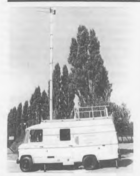
The topical mobile support vehicle (TSI) with mast extended

The Topical Production Centre at Lime Grove is required to cover many diverse events, and for this purpose TCPD engineers have designed and built a self-contained mobile communications unit. Essentially it is a radio link vehicle, but can replay recorded material from a high band 34-inch video recorder and can accept live pictures from a camera. Operationally the vehicle would rendezvous with a standard T.P.C. portable single camera unit at the chosen location. Initially the unit will be used to provide short items of topical material for inclusion in programmes such as Breakfast Time, 60 Minutes and Newsnight.