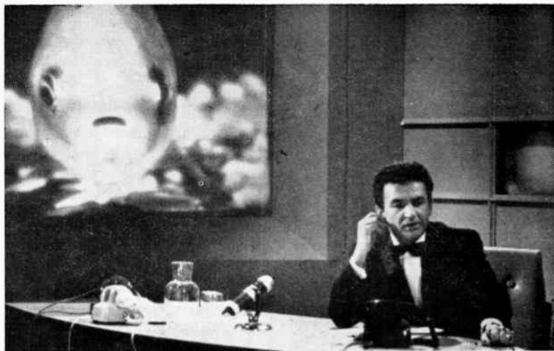
Maurie the goldfish and Bruno Gerussi are hosts of the zany show planned for New Year's Eve entertainment, Friday at 11:30 p.m. For more details, see page 29.

Flipper's natural curiosity gets him tangled up in a cable attached to a dangerous floating mine that could explode any minute.