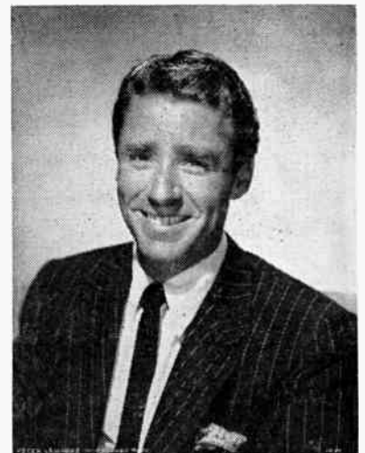
Actor Peter Lawford is one of the celebrity panelists on Password this week. The show is seen Monday through Friday at 2:00 p.m.

The sermon was on the text from Matthew which exhorts us to love those that hate us, do good unto those that revile us. It was overwhelming to sit in that congregation and hear these people murmur "Yes, that's right," "Amen, brother" to these wonderfully loving words; by the time the sermon ended a half an hour later, I was tearful, as I think we all were in varying degrees, because the power of love was so beautifully expressed. King emphasized that the Negro cause must never resort to violence, that to love and forgive was stronger and more moral than to respond in violence.