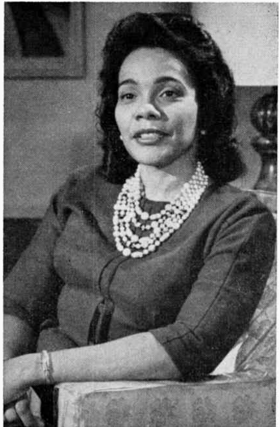
Mrs. Martin Luther King Jr.