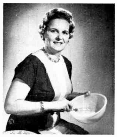
RECIPES FEATURED ON "LADIES FIRST" EACH WEDNESDAY