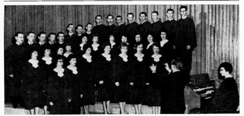
The Mennonite Brethren Bible College a Capella Choir of Winnipeg are heard Thursday at 10:05 p.m. on Parade of Choirs.

Heard on Parade of Choirs Thursday, November 7, at 10:05 p.m., is the Mennonite Brethren Bible College Choir of Winnipeg.