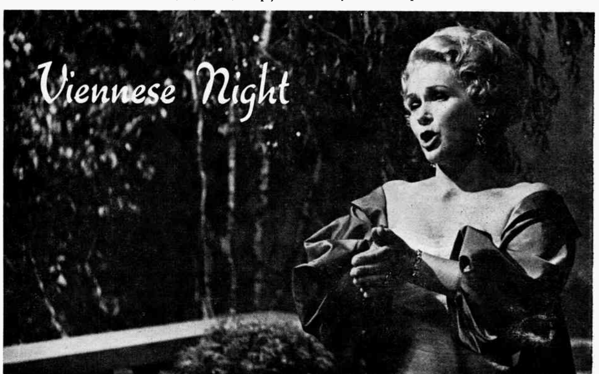
November 2 - 8

Elisabeth Schwartzkopf, internationally renowned soprano.