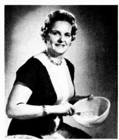
RECIPES FEATURED ON "LADIES FIRST" EACH THURSDAY