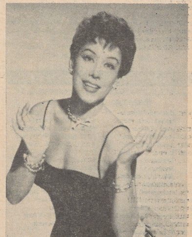
Lovely opera star Patrice Munsel pays a visit to Girl Talk Tuesday morning on CBC-TV.

I Before E Except After C. Willard Mapes, a dedicated school teacher, and Neil Brock face an irate principal and some delinquent students in an attempt to understand the problems affecting minority groups. Starring Howard Da Silva.