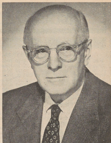
Canadian author and historian Prof. Frank H. Underhill, presents this year's Massey Lectures starting Sunday at 10:35 p.m. The image of Canada put forward by various writers since 1867 is his subject.