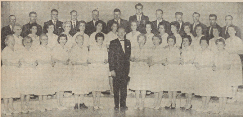
The glee club of Killarney, Man., leads off the season as Parade of Choirs returns to CBC Radio each Thursday night, commencing this week.