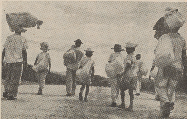
Farm labourers in Brazil.