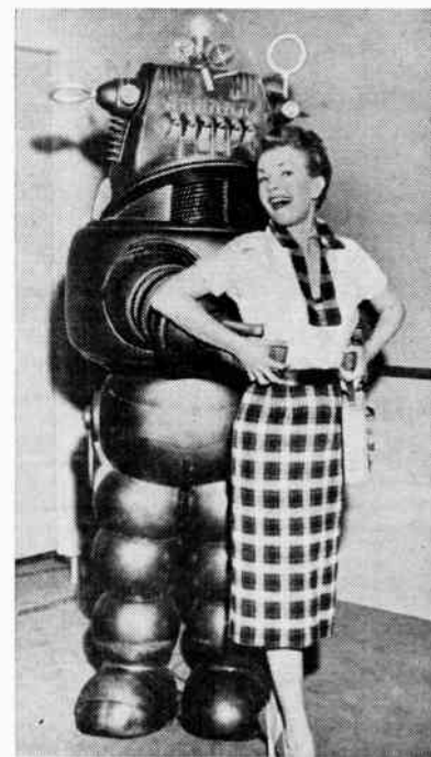
Gale Storm plays a zany ship-board social director in a series of comedies seen each weekday afternoon on CBWT and CBXT.