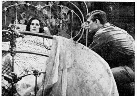
Joan Hackett and Keir Dullea.

He's a graduate of the Neighbourhood Playhouse, spent five summers in stock, appeared on television, and played the young Ernest Hemingway in a drama which closed on its way to Broadway.