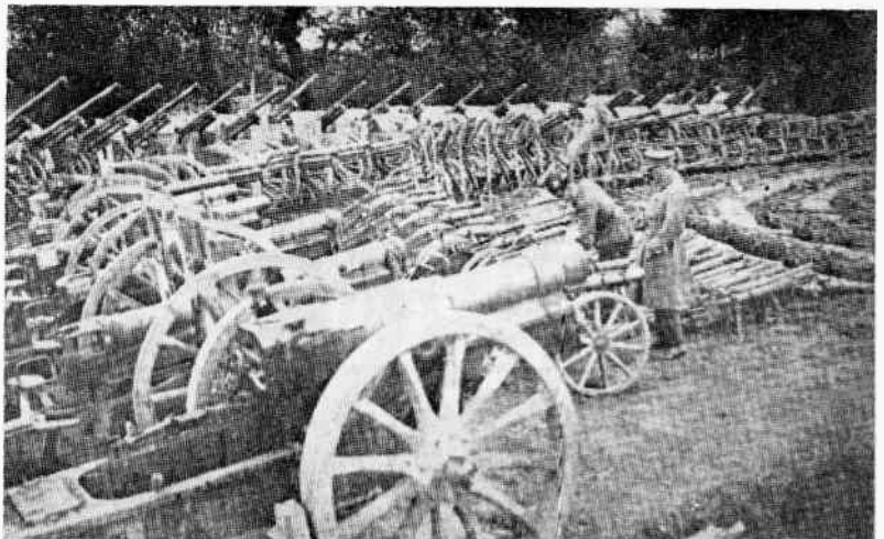
A battery of Canadian artillery in the First World War.

Much of its success the Corps owed to the fact that, while other British corps headquarters saw divisions frequently enter and leave their command, the Canadian Corps was in the unique position of being able to preserve its com- (Please turn to page 31)