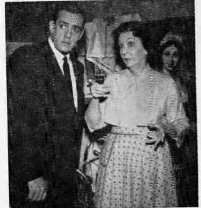
Raymond Burr as Perry Mason, with Zasu Pitts.