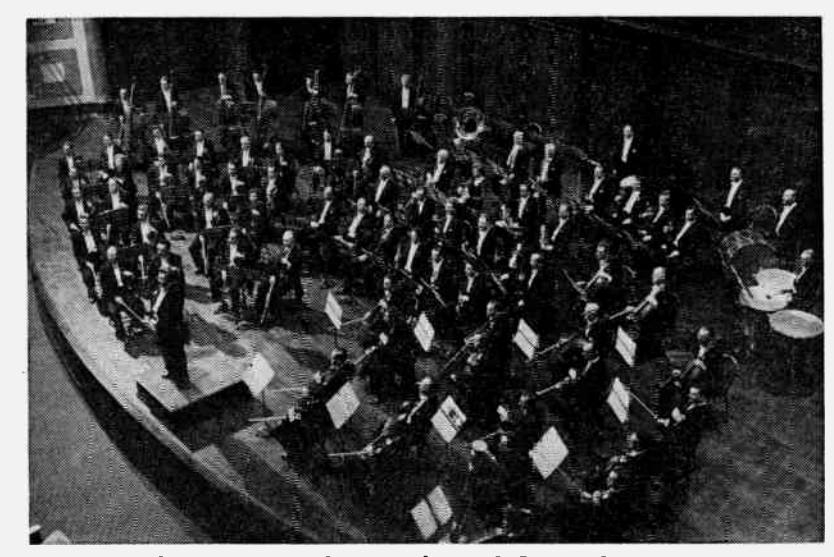
The Montreal Symphony Orchestra is featured this Sunday in another concert on the CBC Trans-Canada Network.