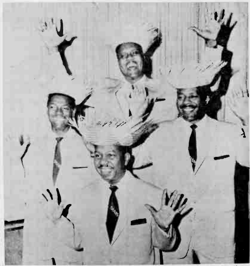
The Deep River Boys are scheduled as special guests Saturday on the "Juliette Show," immediately following the hockey game.

Today - "The Fortune Cookie Caper." When Bentley refuses Peter