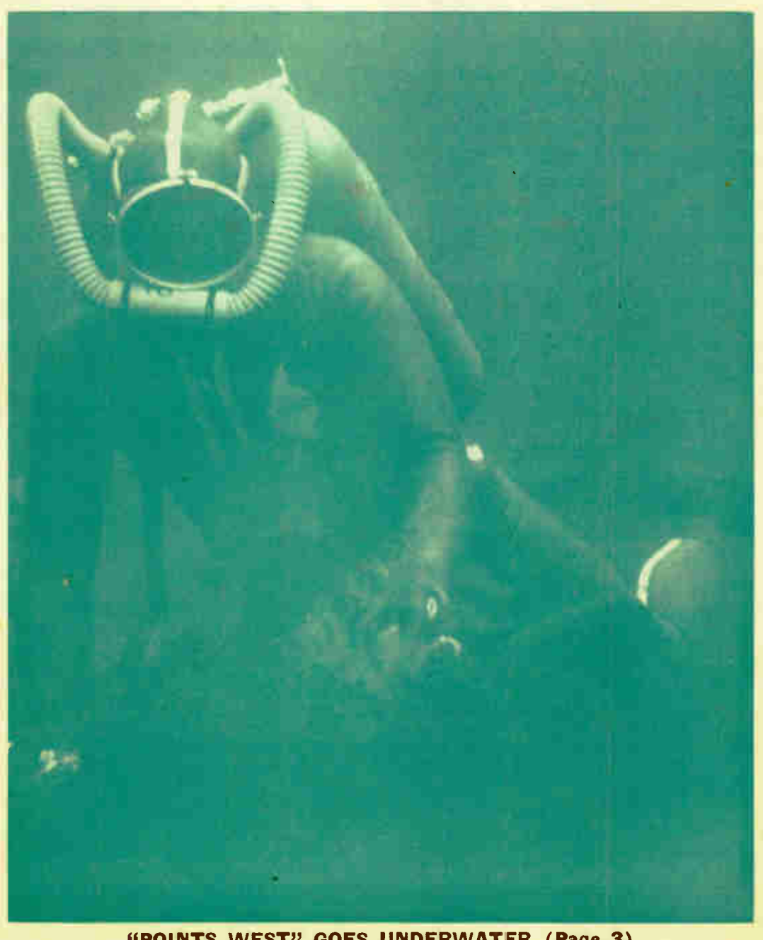
"POINTS WEST" GOES UNDERWATER (Page 3)