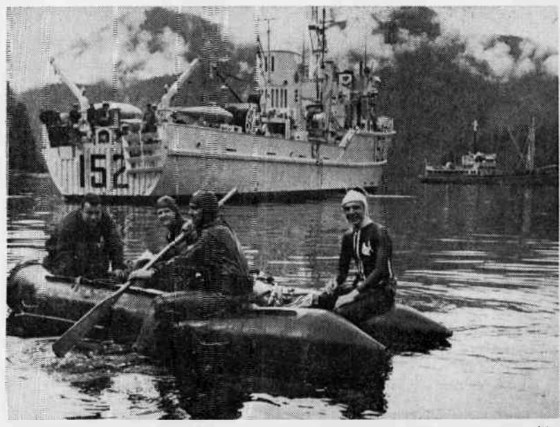
AT THE SCENE OF THE MYSTERY WRECK in Sidney Inlet a group of skindivers prepare to salvage relics from the sunken mystery ship.