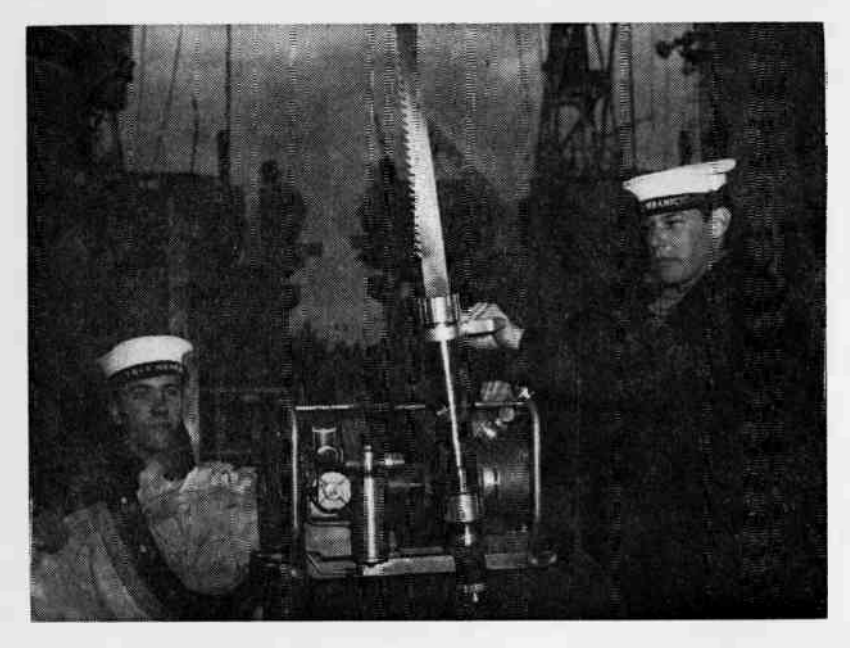
LEFT—Divers check salvaging equipment on the H.M.C.S. Miramichi before leaving Esquimalt to delve into the mystery of an ancient sailing ship discovered last summer at the bottom of Sidney Inlet on Vancouver Island's west coast.