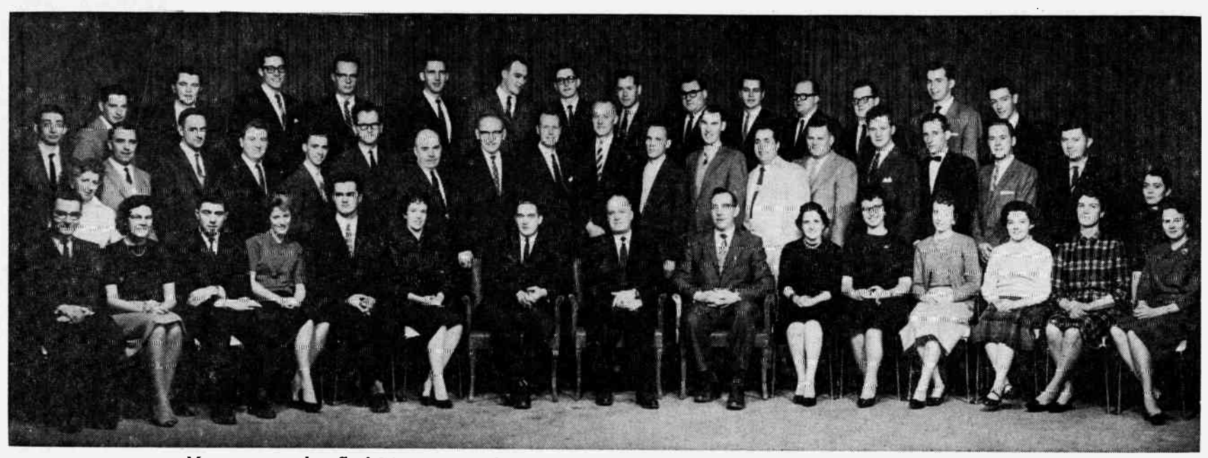
Management and staff of Western Manitoba Broadcasters Ltd., who celebrate CKX-TV's 5th anniversary Jan. 28.