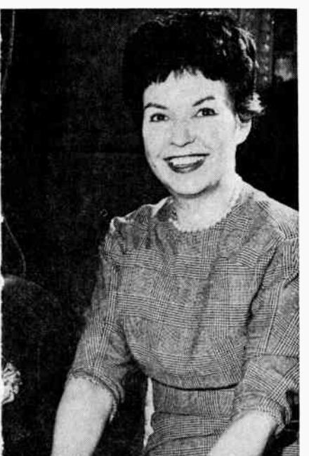
AME EDITH SITWELL.

Q.—How should one read poetry? I don't mean a poet.—I mean me.