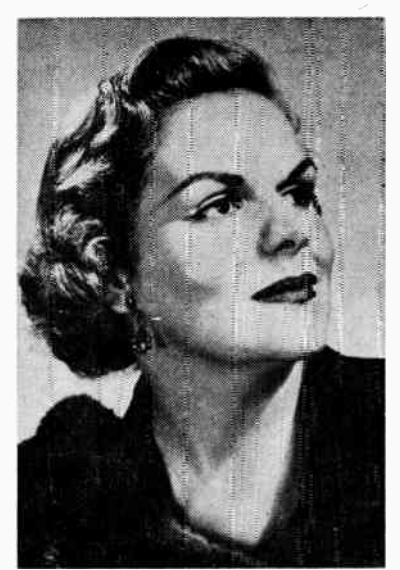
MAUREEN FORRESTER internationally famous contralto of Montreal, presents a one-hour recital on the CBC Celebrity Series this week on CBC Wednesday Night.