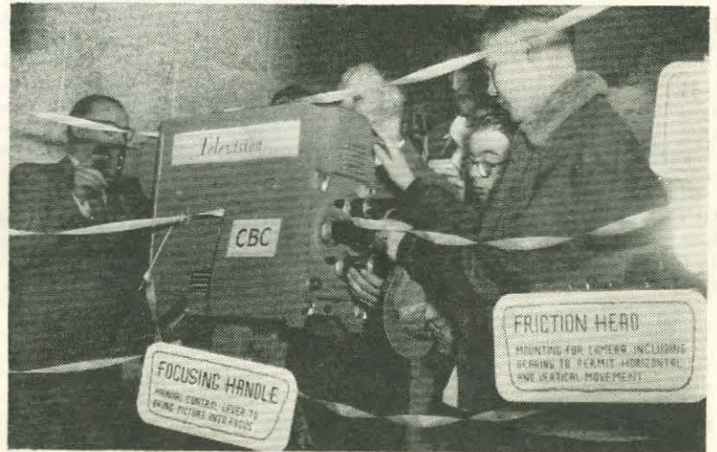
Visitors from Bathgate, N.D.

As they left to return to Bathgate, N.D., they promised to come back again next year for another "look" at radio and TV in Winnipeg.