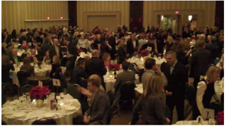
Click on this Photo for a Video Snapshot from the 2010 Broadcast Executives Society Christmas Luncheon